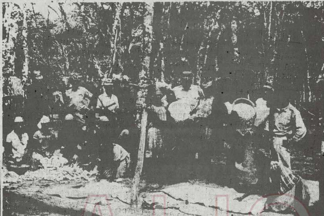
Guerrillas and liberated villagers load maize for Zambia.