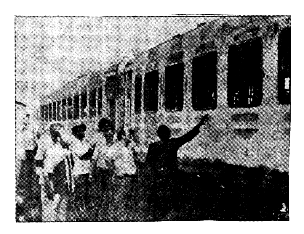
Train recently attacked by the MNR.

According to eyewitness reports, the bandits waved down the vehicle. Tivane stopped, possibility thinking that it was a FPLM road check. As he