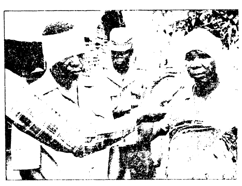
Villagers whose ears were cut off by armed bandits in Gorongosa in 1979.