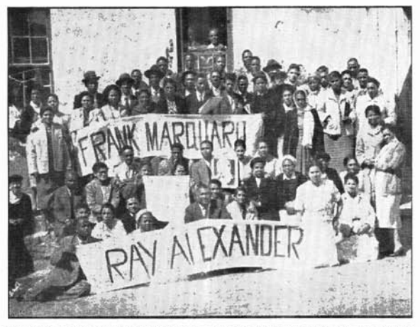
With bannets and portraits of their banned leaders, delegates to the annual conference of the Food and Canning Workers' Union last week-end pose for the New Age photographer.

Several organisations are repre-sented on the committee, including the local Congresses, civic bodies, the Black Sash, the Civil Rights League and the Institute of Race Relations.