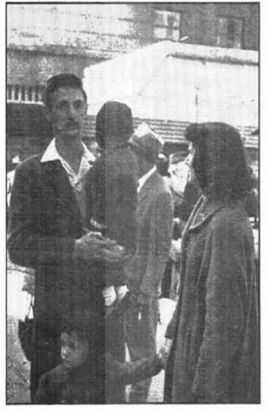
"Released" - By whom?