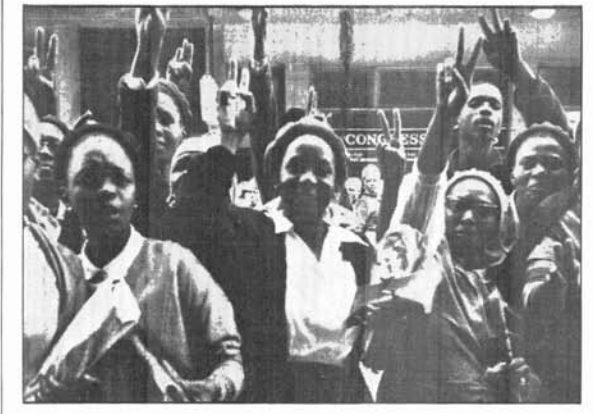
VICTORY FOR CANNING WORKERS: Two fingers in the air means "two shillings an hour overtime pay."

CAPE TOWN. The Committee for the Safeguard of the Non-racial Franchise will call a conference in the Library, City Hall, on Monday, March 2, at