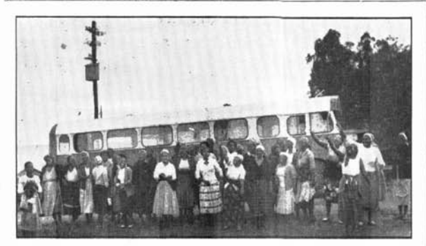
Women demonstrators who picketed the bus terminal during the boycott at Kwa-Mauhu sing and wave farewell to a pick-up van which had just left the scene. Inside the bus can be seen the only occupant, a senior official of the Council's Transport Department.