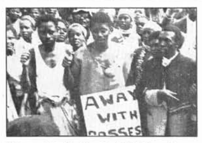
These men dressed in the sacks of Rethal farm labourer symbolise the protest against the pass laws.