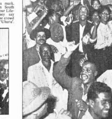
Volunteers carry Chief Lutuli shoulder high after the successful Africa Day meeting held in Durban