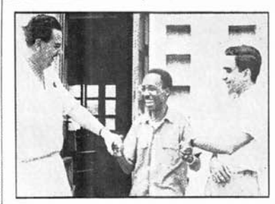
Nyerere with European and Asian friends

Again in Kerala' Self-government NOW. FORWARD FOR TANGANYIKA GANYIKA AFRICAN NANAD INDEPENDENCE IN 5 AS OUTLINED BY THE LEA- TIONAL UNION (TANU) MR. YEARS. THIS IS THE WAY (DER OF THE POWERFUL TAN) JULIUS NYERERE.