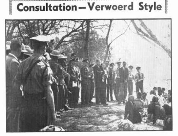
Flanked by a strong posse of police, the Assistant Native Commissioner meets women delegates at Suther-lands, Maritzburg, to hear their grievances.