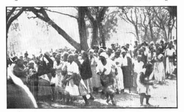
Women from Table Mountain, near Maritzburg, react angrily when they discover that women fro Edendale with whom they were to hold a meeting have been arrested for being in possession