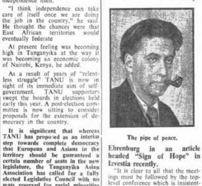
The pipe of peace.

THE Eisenhower-Kruschov exchange can mark the dawn of a new era in international relations and change the life of the whole of mankind, writes the Soviet novelist Ilya