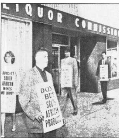
Canadian trade unionists have backed the call for an overseas boycott Calinatian Bride dimensions norte packate use car for an overseen survivor of South African goods, Here are some of them on the picket line outside a liquor store in Winnipeg. The Quebec Provincial Federation of Labour has sent a strong prodest to the Atforrey General calling for a ban on the import of South African wines and brandles by the Liquor Commission.

"The Government must be held solely responsible if the resentment and frustration of the people takes on more drastic forms of protest."