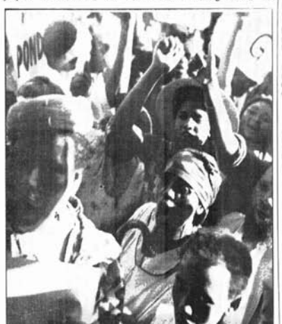
retoria crowd sang freedom songs, but switched to som-when Dag did not respond to the people in any way.