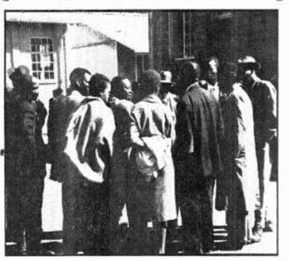
A group of people from the municipal townships of Johannesburg waiting outside the Kliptown, Johannesburg, Magistrate's Courts to nawer charges that they are in arrears with their rents. This Court hears 4,000 cases a month on these charges—and they are all criminal charges.

houses is a loan from the Housing Commission which must be repaid. The rents are laid down by the