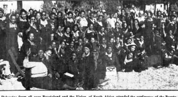
Delegates from all over Basutoland and the Union of South Africa attended the conference of the Basuto