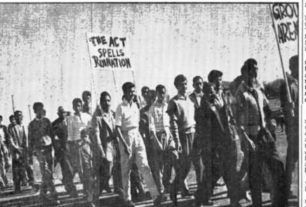
Evaton Indians-joined by Coloureds and Africans-demonstrated against the Group Areas Board hearing in the Residensia Town Hall on Monday

The police informed the people The people decided to boycott buses would be protected. Police The people decided to beyout buses would be protected. Police the streets in numbers without parallel. Despite the lack of arms, the people were ready to meet the in yearders. The people decided to beyout buses would be protected. Police the streets in numbers without parallel. Despite the lack of arms, the people were ready to meet the in Gentleman and the protected the people were ready to meet the in Gentleman and they remained empty. The bus company stated later that the people were ready to meet the in Gentleman and they remained empty.