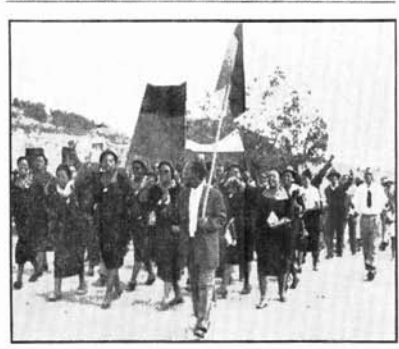
Men, women and children took part in this demonstration in Maseru sutoland, recently, singing freedom songs and demanding an end to imperialism and colonialism in all its forms.

In addition to widespread raids in the townships and on the homes of coloured leaders, the homes of some members of the Liberal and Progressive Parties were also raided. Some COD executive members were raided, others not. The offices and homes of most people working on New Age were not visited.