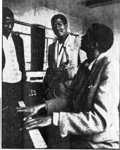
ner amateur status, of course. A cable wa, also sent to the Forcign Minister al UNO: URGE of the Dark Chamber' opening in Durban on October 5 take a break YOU ATTACK THREAT TO FISH AND CHIP BUSINESS and a terr a grueiling session on the stage. Members of the multi-racial cast INTERFERENCE IN DOMES-INTERFERENCE IN DOMES-ITC AFFARS. The following reply was re-fol hours daily every day including Sundays since last month, and pro-ceived SAIE JAMMER COMAG