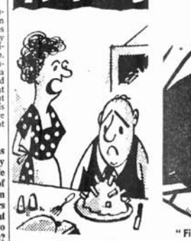
But you always said you en joyed a good mustary

But Western efforts to hold Nehru's hand have been unable to overcome popular feeling—and this will not be the last time that this occurs. The forces of peace and anti-colonialism are gaining strength every day and one can look forward to neve nearber vice strength every day and one can look forward to even preater vic-tories against imperialism. The liberation of Goa is the fore-runner of freedom for Angola, Mocambique and the whole of Africa-not to mention Portugal itself.