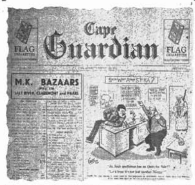
The front page of the first Guardian consisted entirely of adverts, with the exception of the cartoon dealing with Hitler's ambitions to regain a colonial empire.