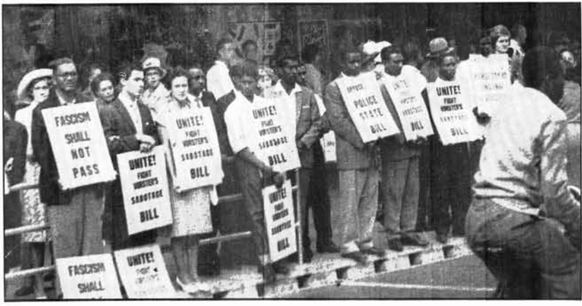
A section of the large number of demonstrators who lined a Durban street in protest against Vorster's anti-Sabotage Bill.

It is now up to the people and their leaders to prove the Nats wrong. And the first step is to strain every nerve to mobilise total opposition to this Bill at every stage. It is not a threat only to saboteurs, but to everybody who loves freedom.