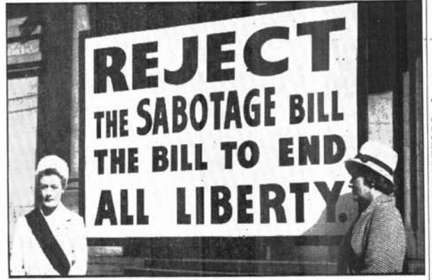
Members of the Black Sash stand silently during their vigil on the steps of the Johannesburg City Hall.