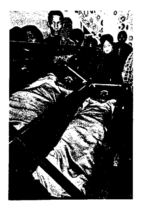
Mourners pass Stephen Biko's coffin

In mid-year more than a dozen organizations answered the call of the Black People's Convention and met to put together a coordinated campaign against "separate development."