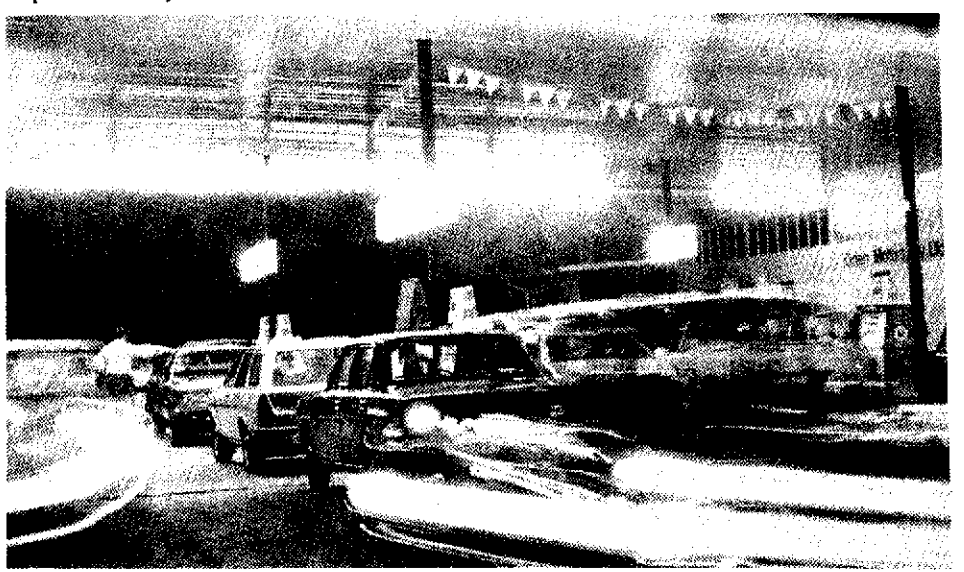
Feeling the pinch: gas lines in Pretoria

So far, higher earnings for gold and mineral exports, which have also experienced rapid price rises, have cushioned the financial effects of the oil squeeze on South Africa.