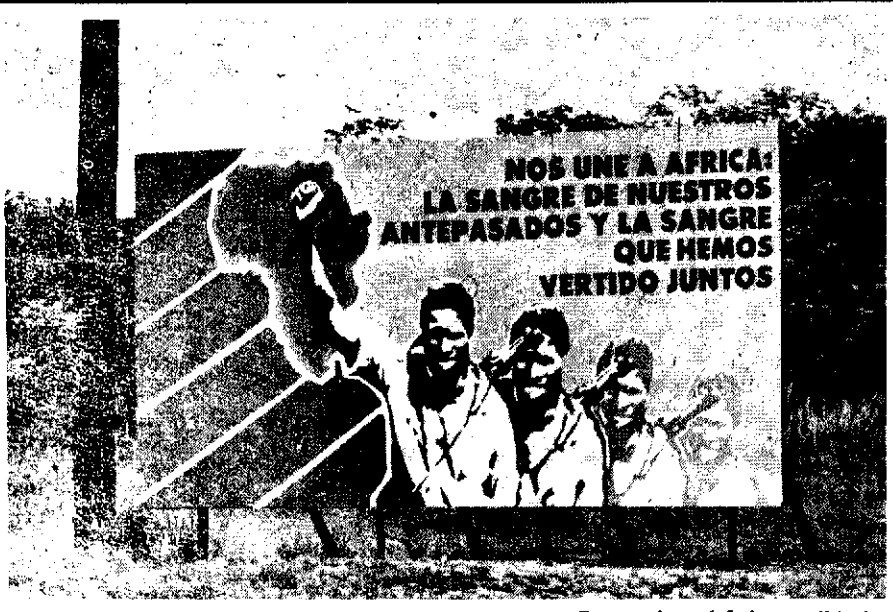
Expression of Cuban solidarity

The 15 boys and three girls follow the same schedule as the Cuban students: a course of study which touches upon ten subjects taught in Spanish as well as a half day's work daily in the surrounding fields. The general model is one largely of assimilation. There is an assumption that what is to be learned is relevant to both the Cuban and the Guinean experience. The young people from Guinea-Bissau work and study on the same schedule as Cuban children, they participate in the same extracurricular activities, and on the weekends when most Cuban children return home to their parents, the Guineans often go with