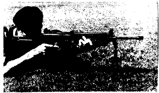
South African produced R-4 assault rifle

Despite the UN Security Council's passage of the mandatory arms embargo against South Africa in November 1977, evidence continues to pile up that the apartheid regime has had little difficulty acquiring the sophisticated weapons it desires from other countries, and that US equipment makes up much of the flow. There is becoming increasingly self-sufficient in light weapons production and in the production of some sophisticated military hardware such as combat helicopters.