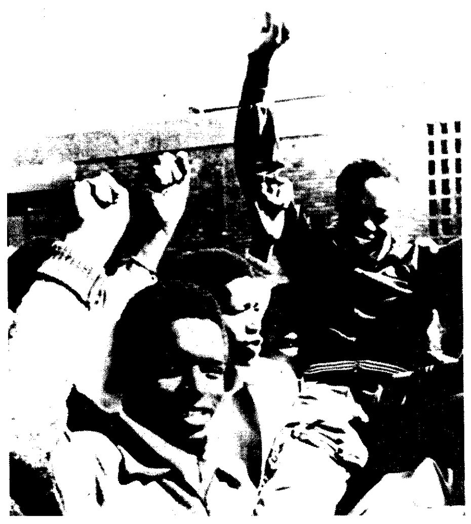
The struggle will continue: One of the many militant students charged in the courts, gives the power salute after receiving a suspended sentence at the end of the "Soweto Eleven" trial in May

Despite the veil of secrecy behind which South Africa attempts to hide political opposition, the rising number of political trials and convicted political prisoners indicates the continuing growth of the resistance.