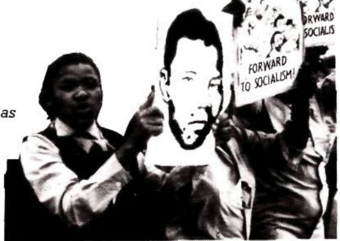
Continued on page 2 ...

The alliance between our Party and the ANC has no secret clauses. Despite unending onslaughts against it from many quarters, this alliance has survived and grown more firm.