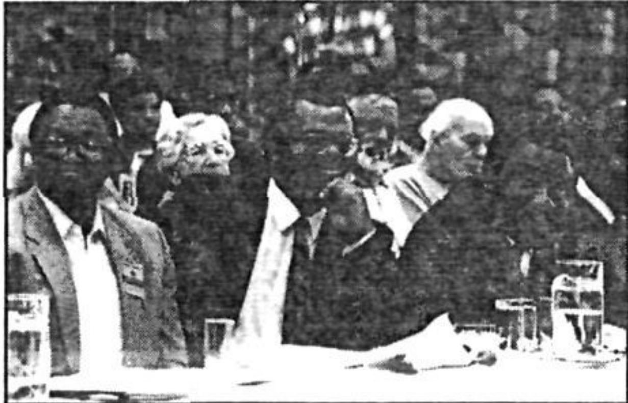
Deep in thought: Popo Molefe, Steve Tshwete and Cyril Ramaphosa