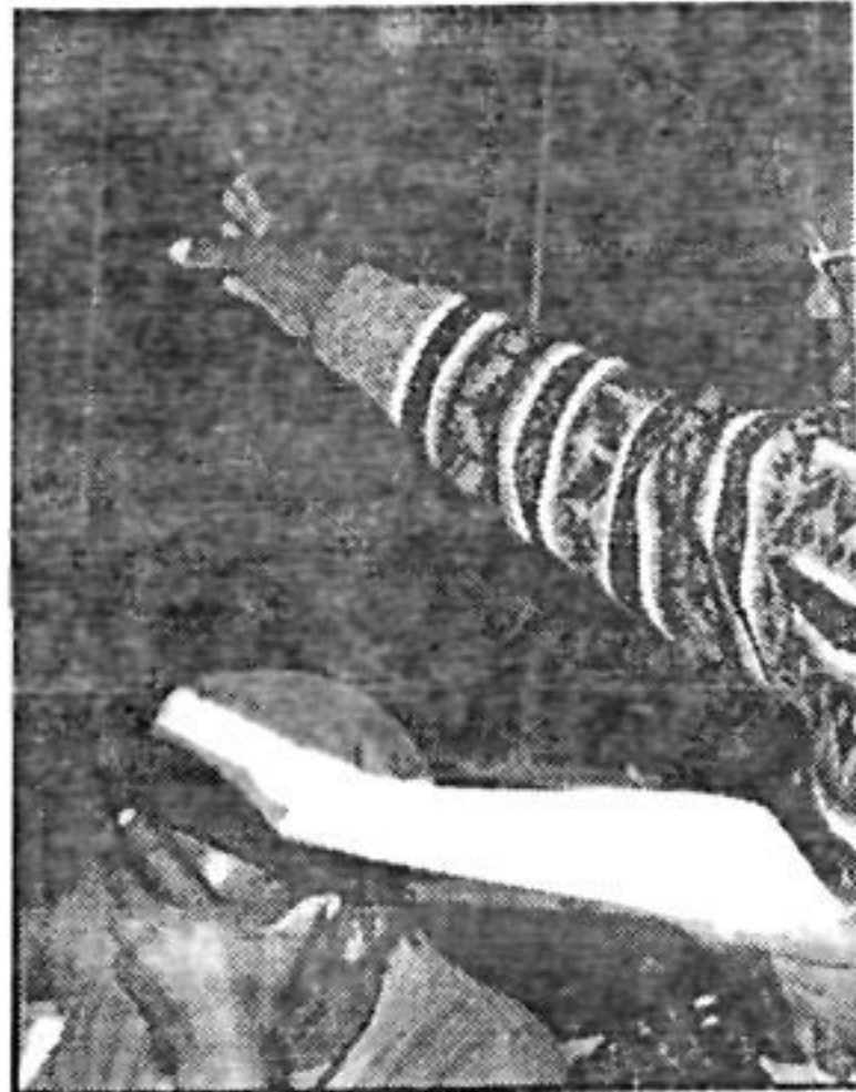
'We need to move forward, comrades...' Eastern C commis: