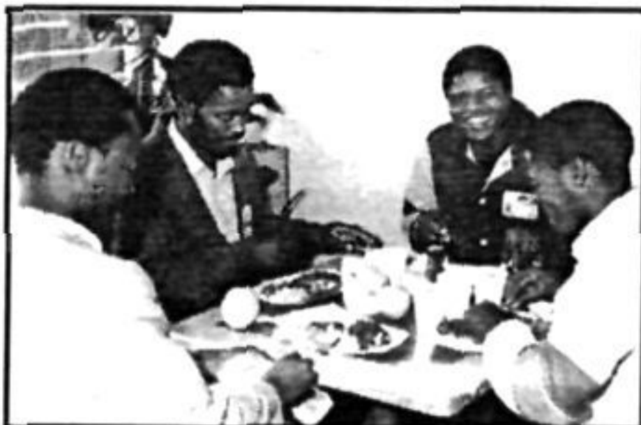
Enjoying the food: During meal times, delegates were able to listen to tapes made by local comrades trained in broadcasting