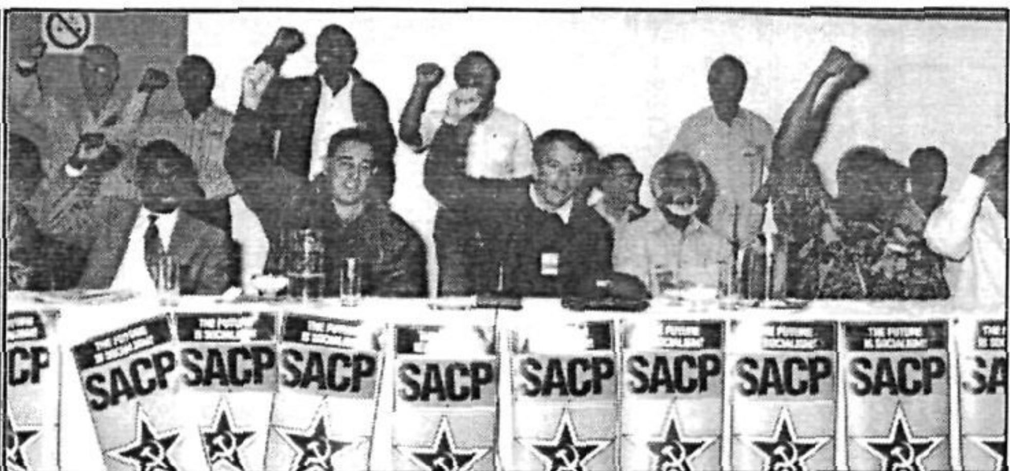
A salute from the party's new office-bearers