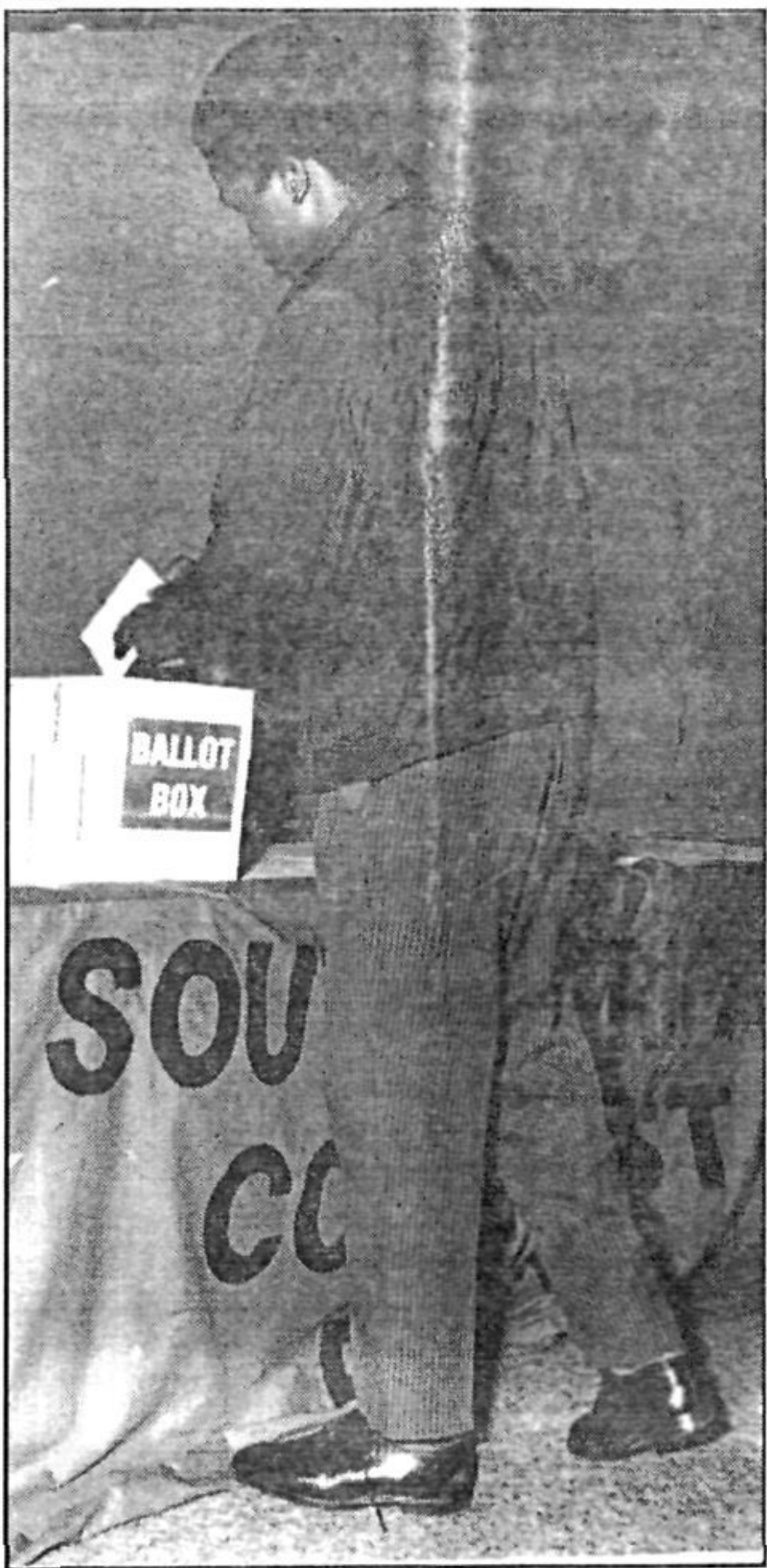
One delegate, one vote!

"The only way which to ensure socialism triumphs is to ensure that the demands in the Freedom Charter are realised in a post apartheid society." ★