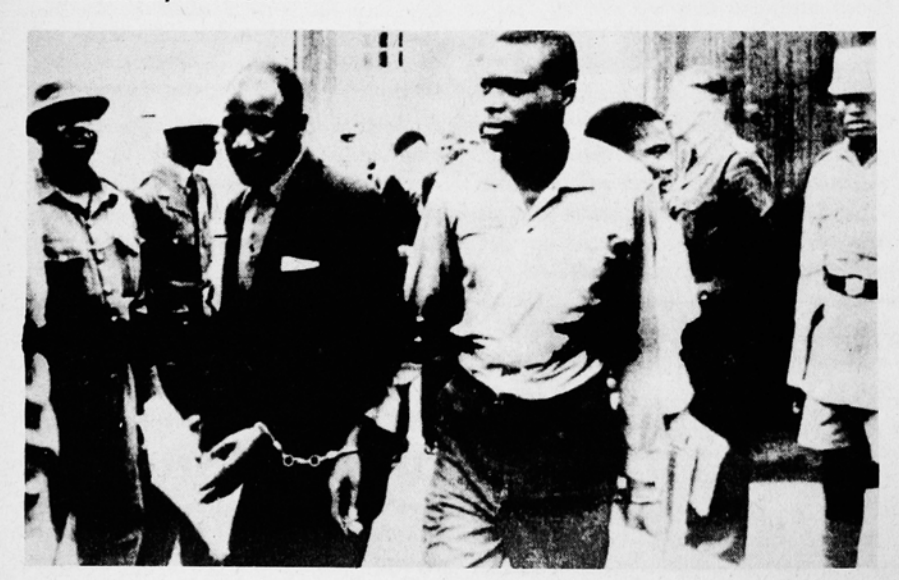
Two Freedom-Fighters handcuffed to each other are seen being led to the Salisbury Police Station

they are doing a great deal for the Africans. The Africans rightly regard this arrogant paternalism as an insult. Why must the white racist "do something" for the Africans educationally while they do everything (including murdering, torturing and displacing them) to suppress and deny them basic human rights acquired through universal adult franchise?