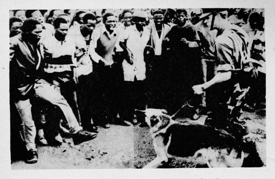
Zimbabwean workers and peasants march side by side against minority rule