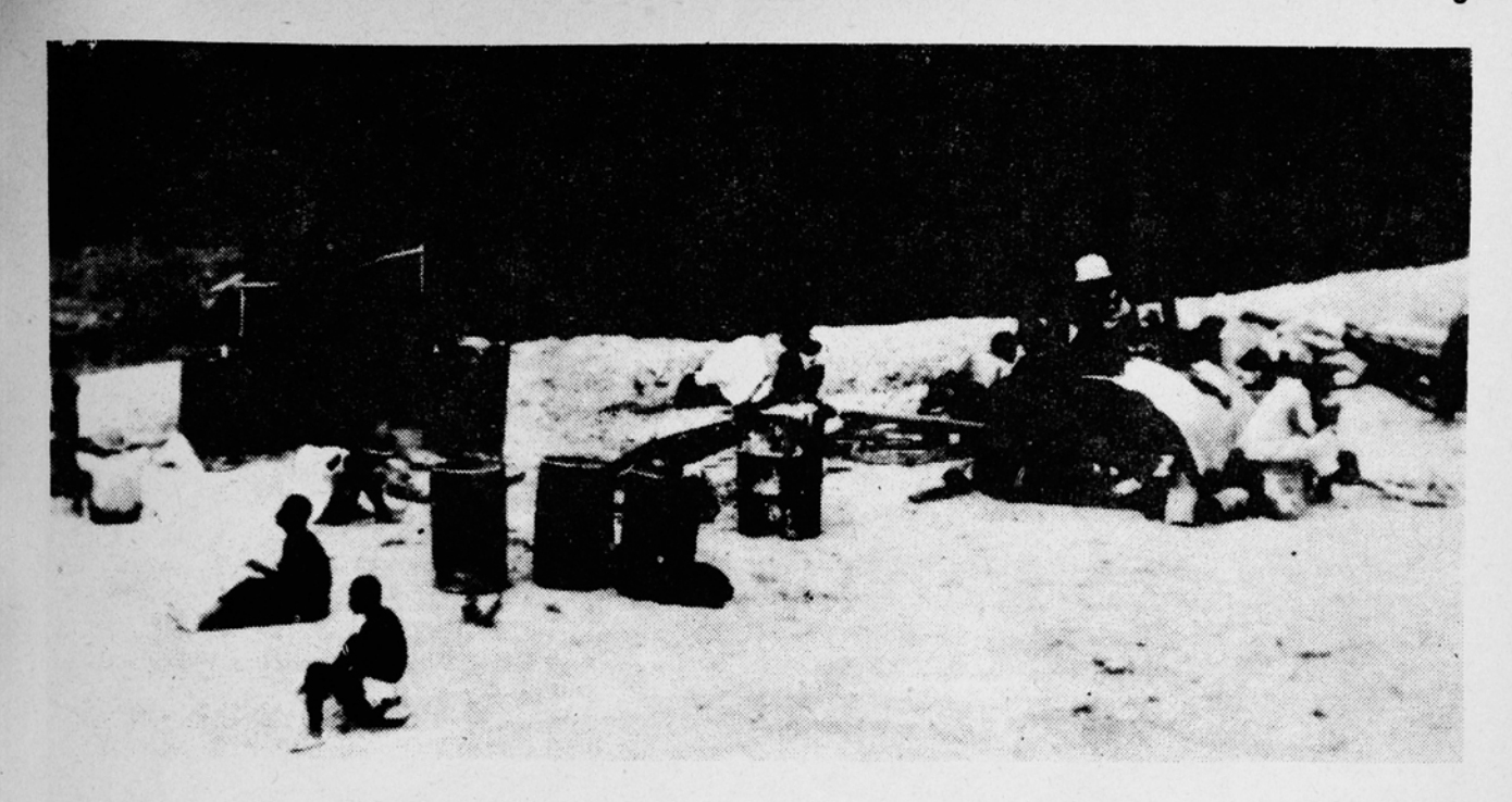
Homeless Africans after their villages were bull-dozed by the Rhodesian regime

people's leaders in the Matopo Hills, a few miles outside Bulawayo, where freedom fighters had dug in for several months.