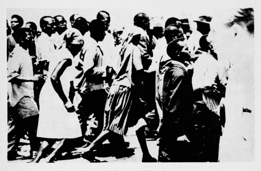
Vicious Alsatian police dogs are a daily feature in Rhodesia