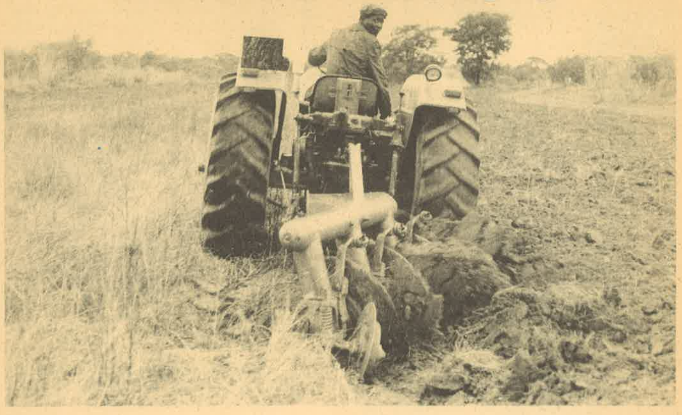
A comrade ploughing the little plot in Zambia. This plot will be planted with maize.