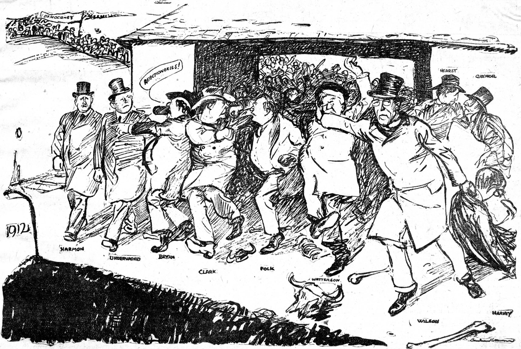
"Through a slaughter house to an open grave."—COLONEL WATTERSON.