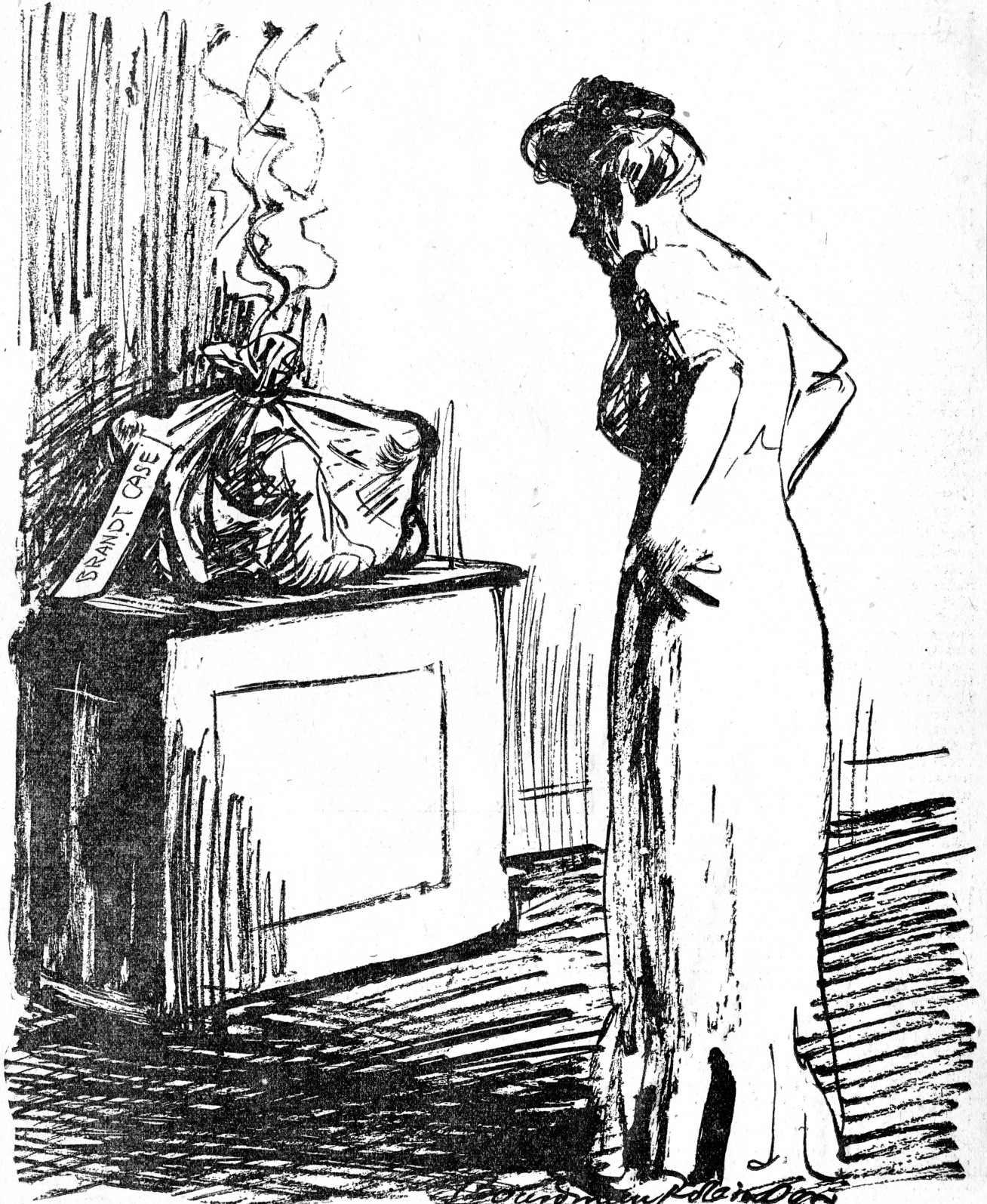
THE PUBLIC—What's in that queer-looking package, anyway?