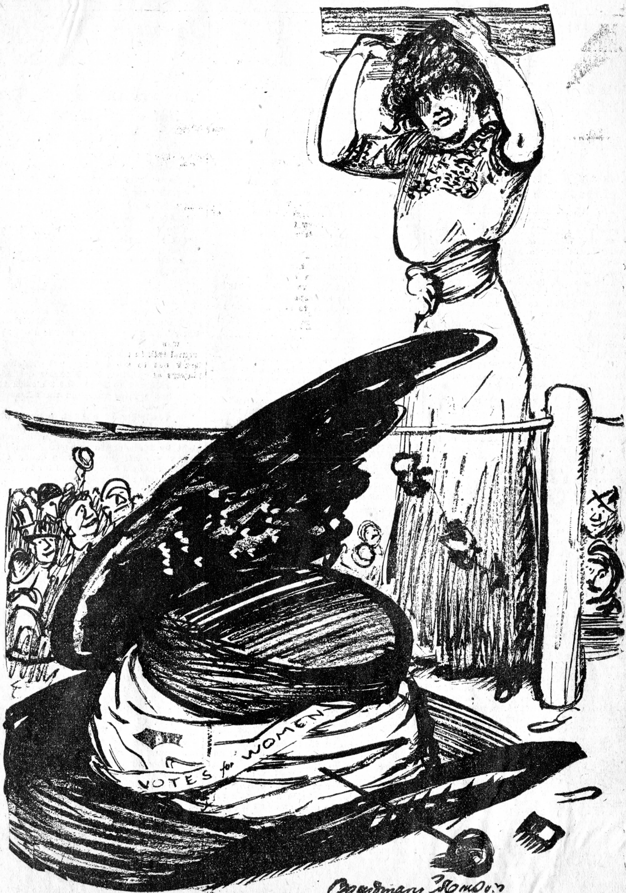
SUFFRAGETTE—"My Hat's in the Ring."