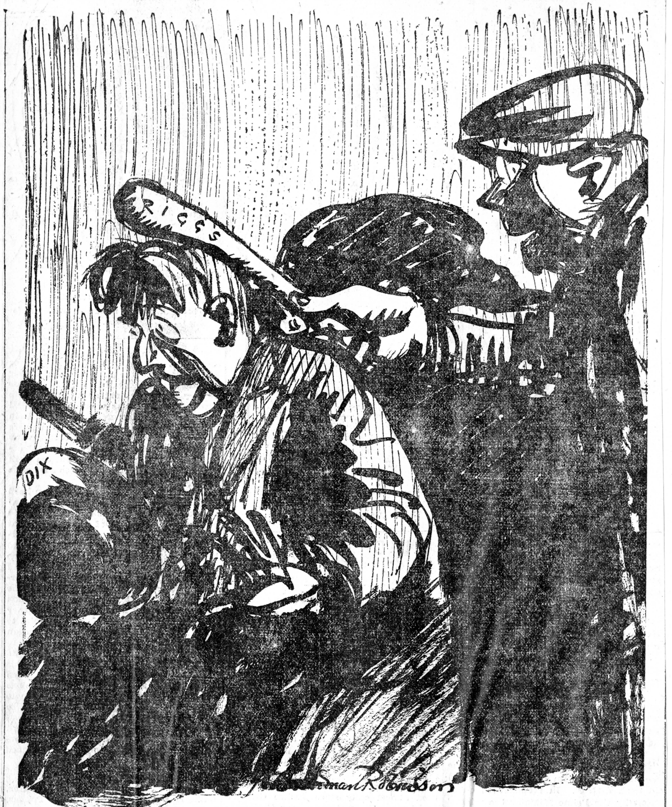
THE CRIME WAVE AT ALBANY.