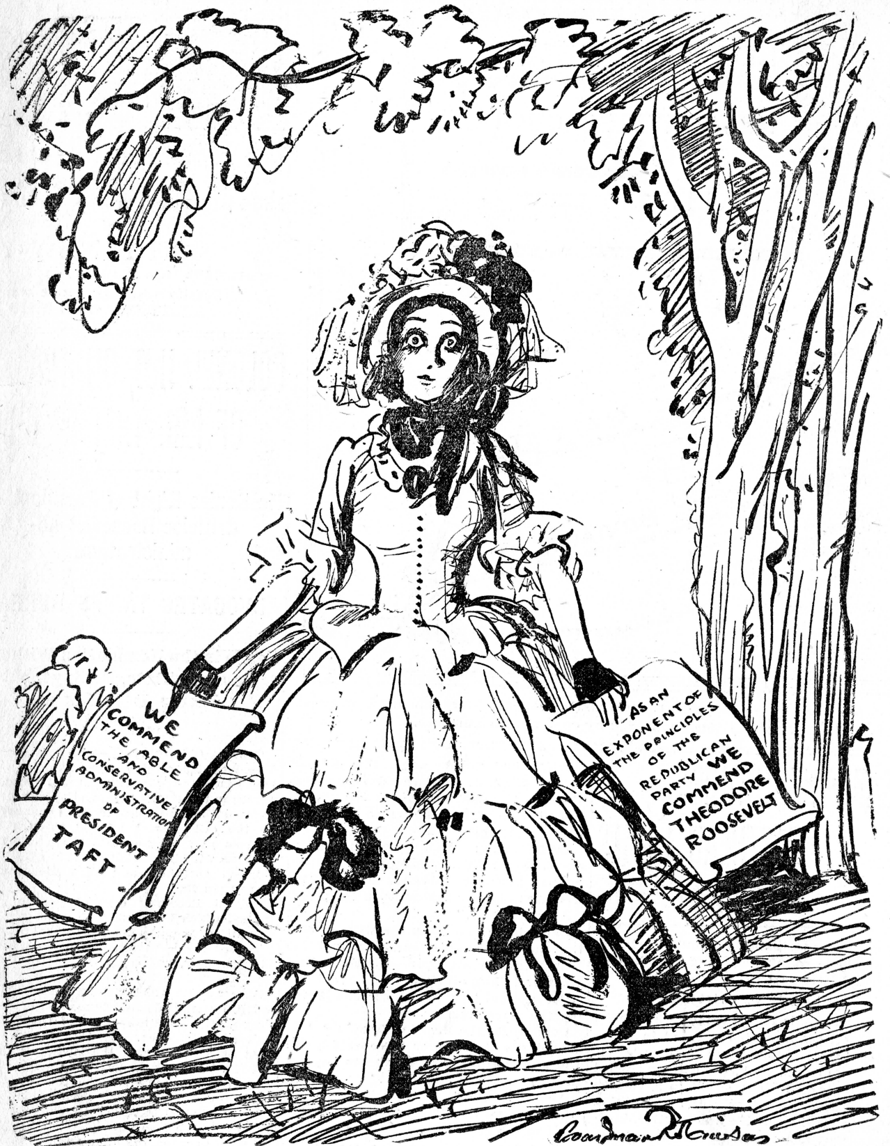
"MARYLAND, MY MARYLAND."