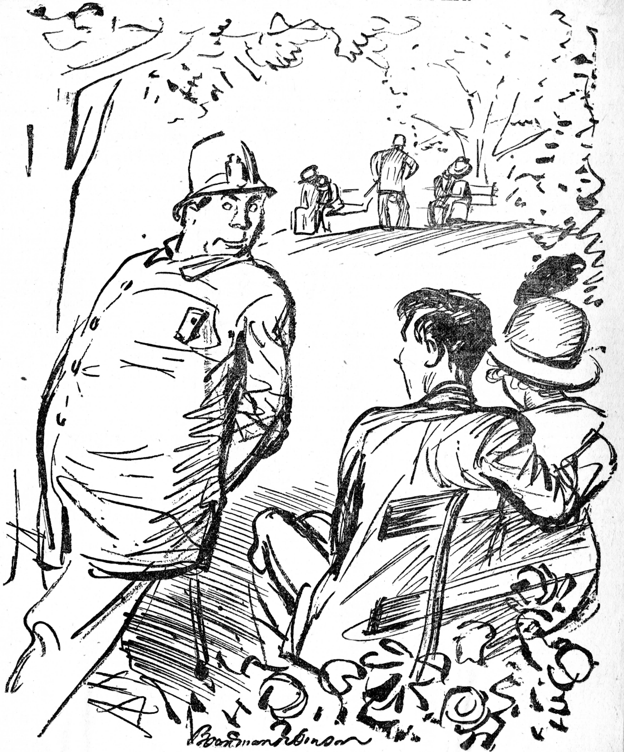
It is suggested that policemen be directed to "look reproachfully" at park spooners.