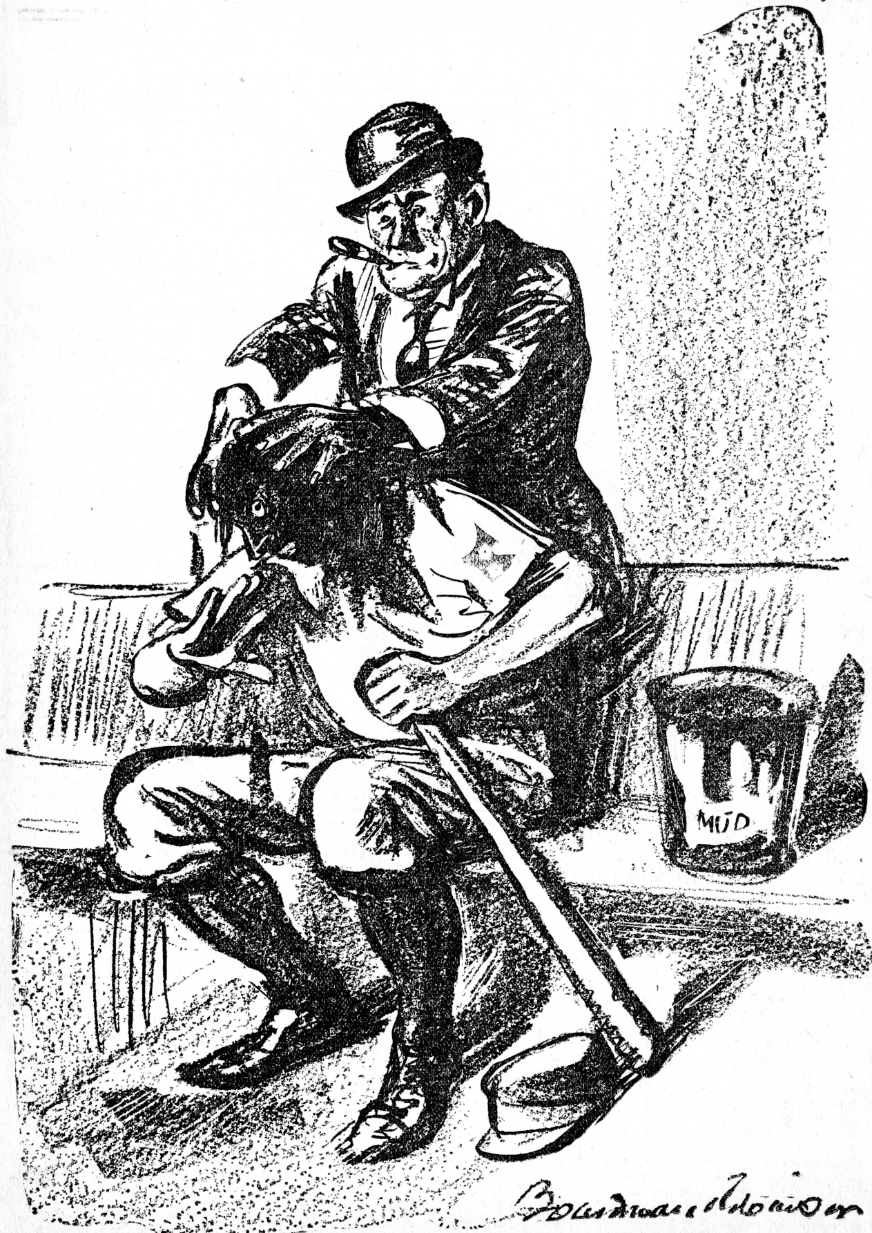
Would disfigure baseball as it did horse racing.