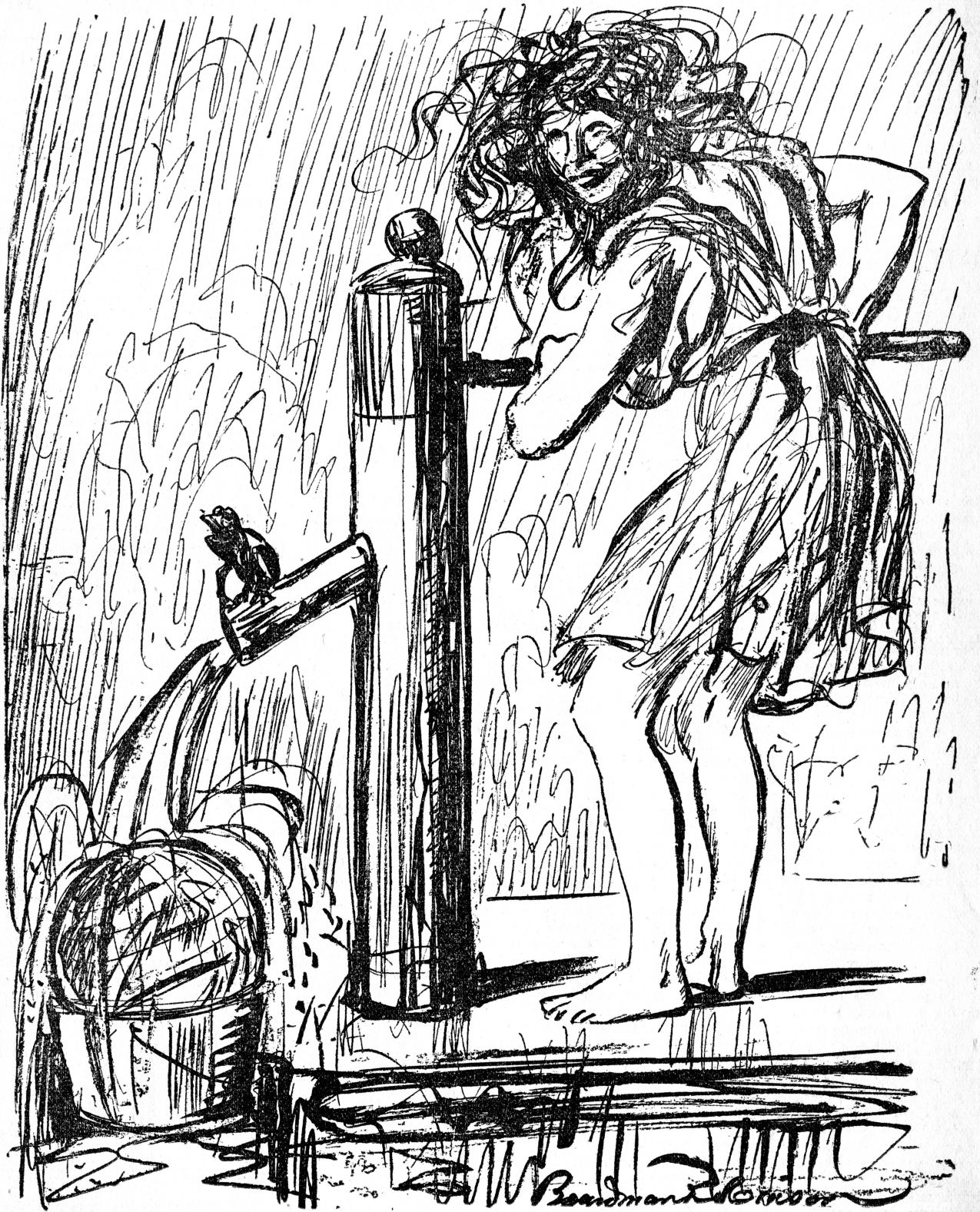
Oh, treacherous month of May!