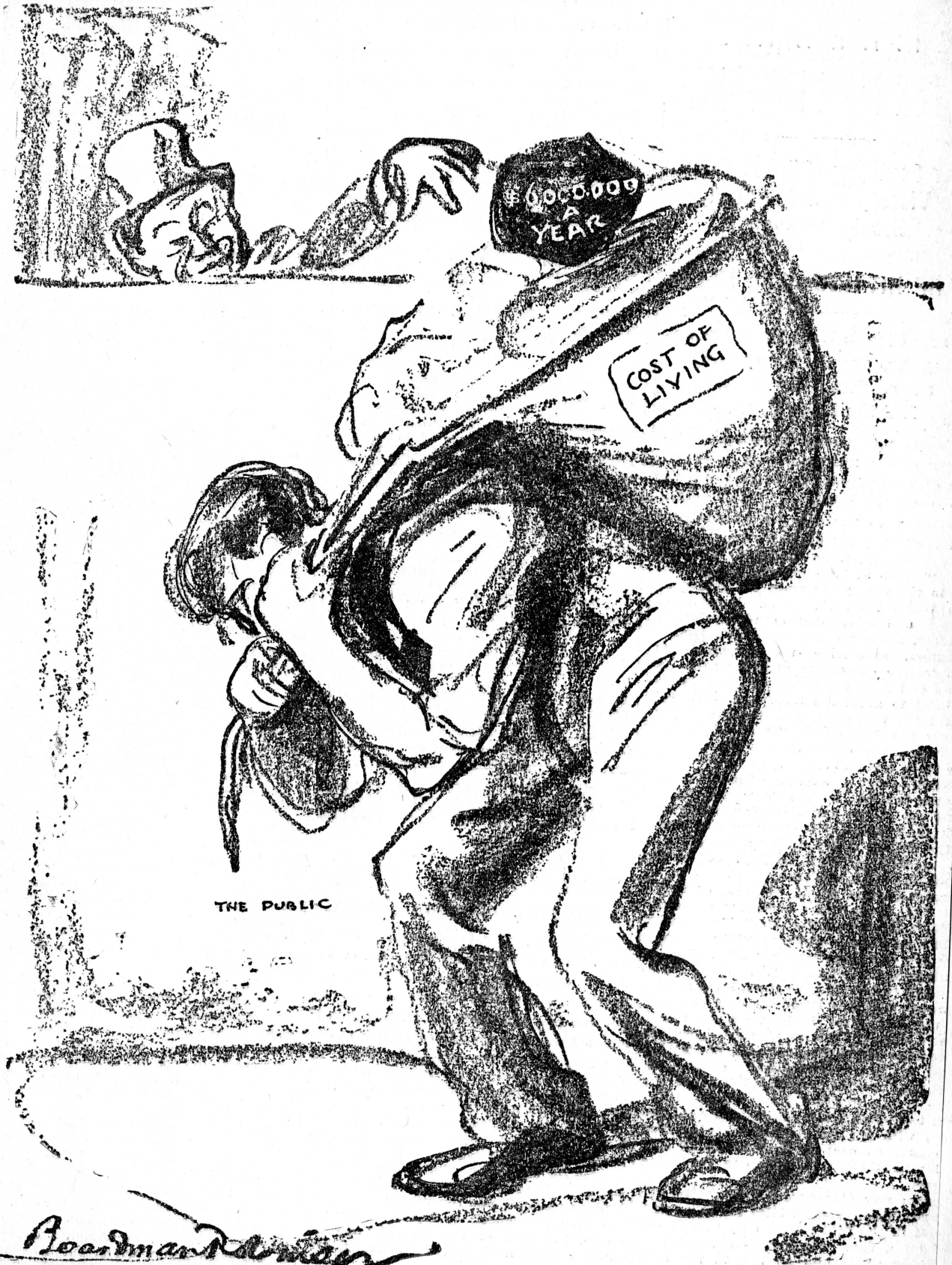
COAL BARON—What's a little thing like that to such a big fellow?