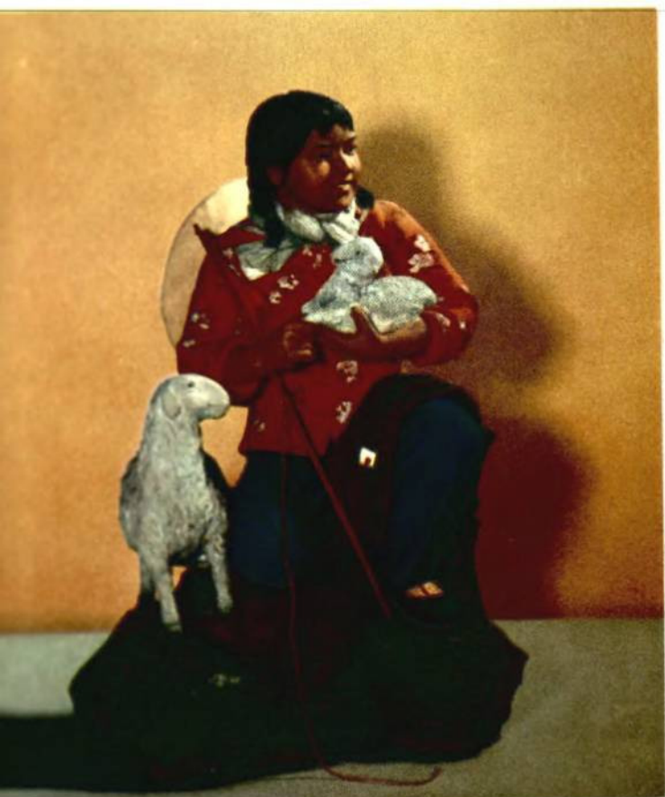
A young member of the people's commune (left) holding a lamb.