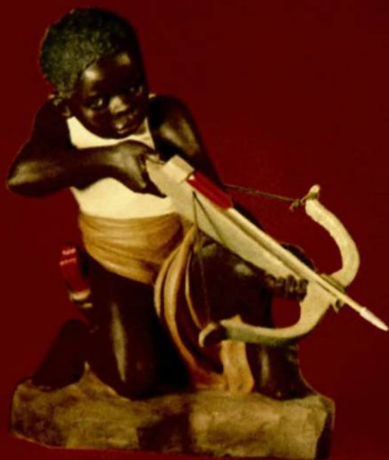
A Courageous Boy (clay figure)