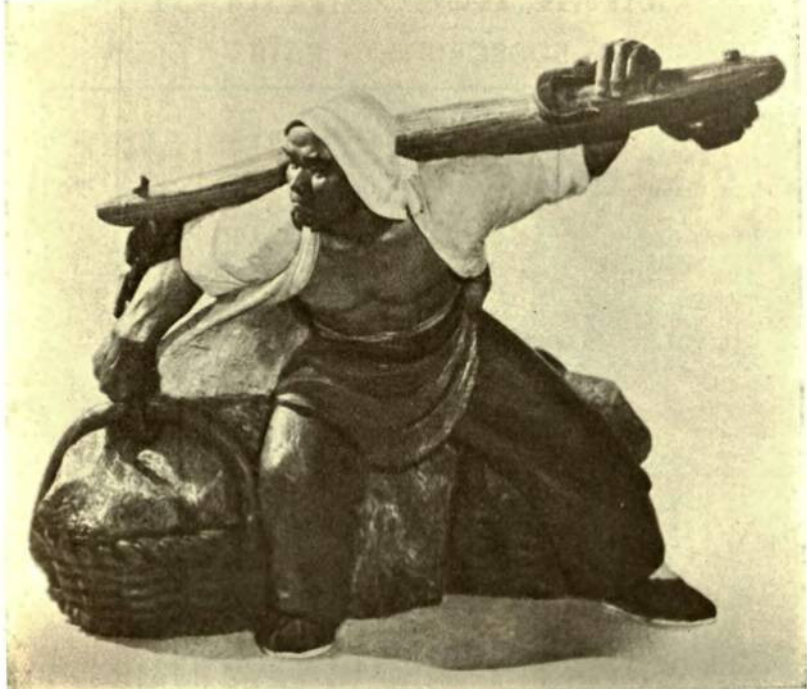
At work on a water conservation project. (Clay figure)