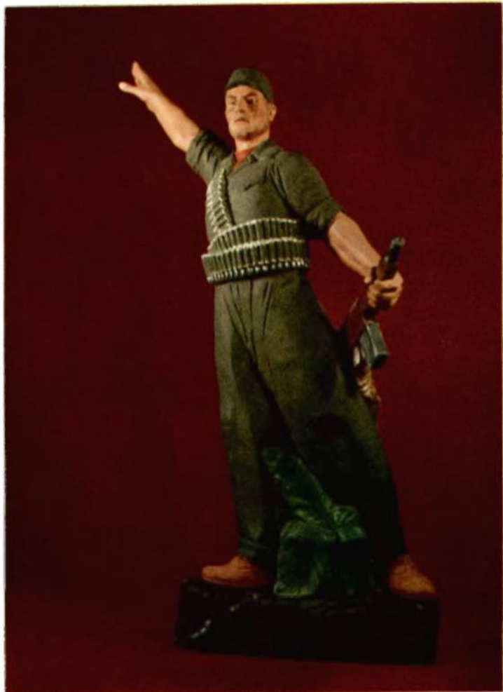
Victory Belongs to the Latin-American People (clay figure)