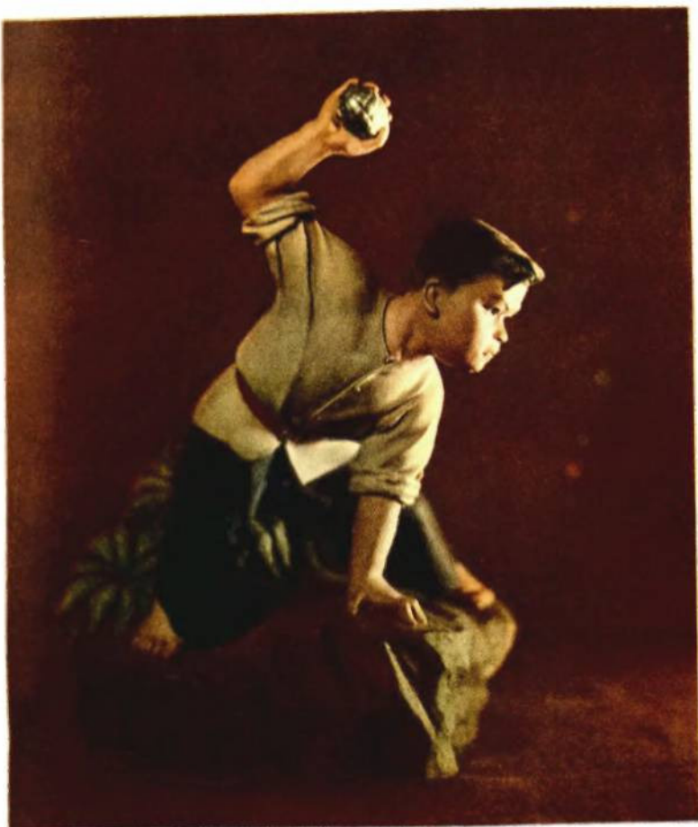
Vietnam: A grenade for the U.S. aggressors ( clay figure )