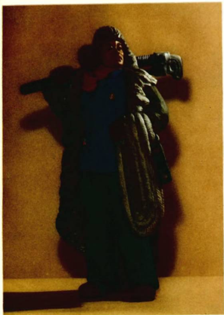
Oil Worker (clay figure)