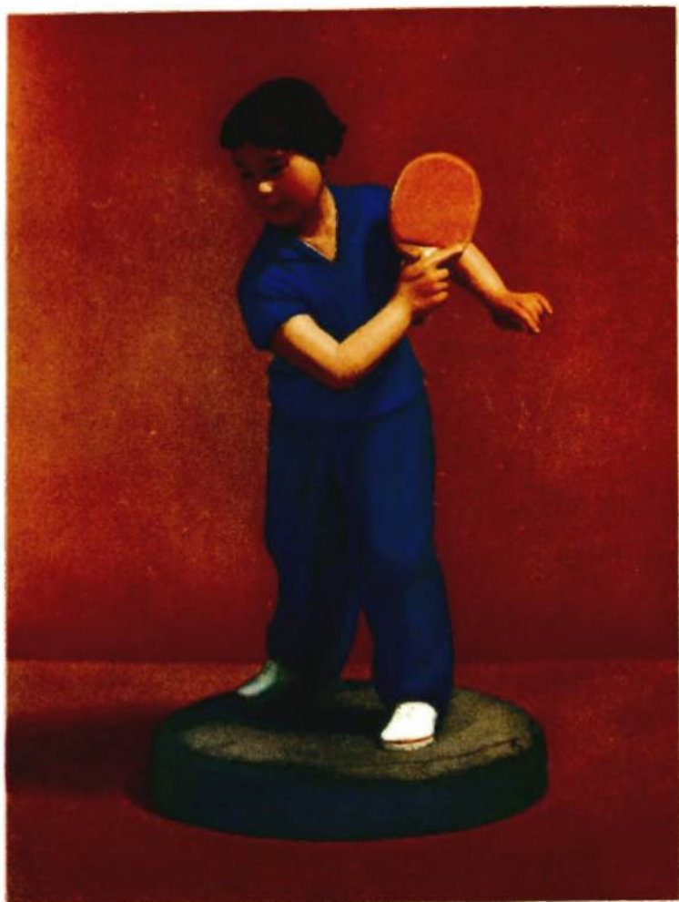
Young Table-Tennis Player (Clay figure)