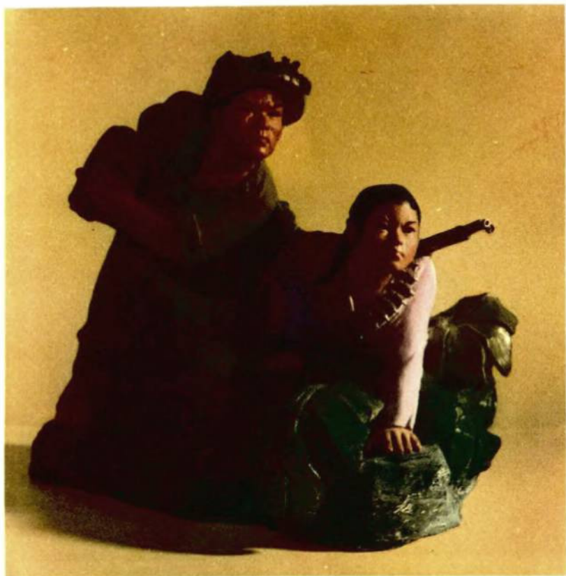
Guerrillas of South Vietnam ( Clay figures )