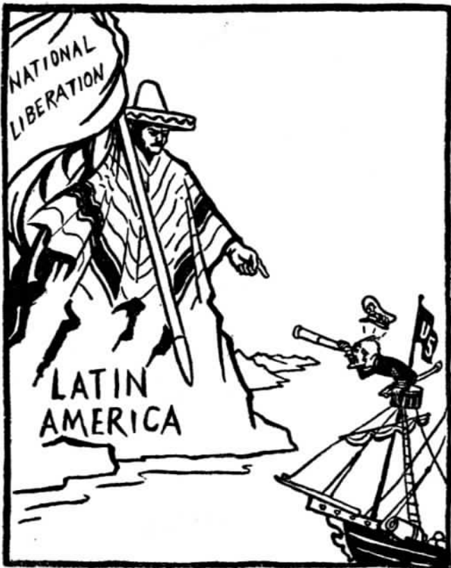
Washington discovers America Cartoon by Chiang Yu-sheng

own party. A state of siege was proclaimed and the army and police were ordered out to suppress public demonstrations.