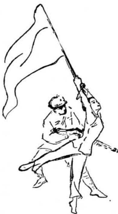
From The Immortals Sketch by Li Ke-yu

The sentiments expressed in the poem are projected on the stage in dancing and pantomime to music on traditional Chinese instruments. The first scenes—the rescue and storming of the Kuomintang county seat—are full of action and vividly danced and mimed. But what in the poem is lyrical and evocative becomes