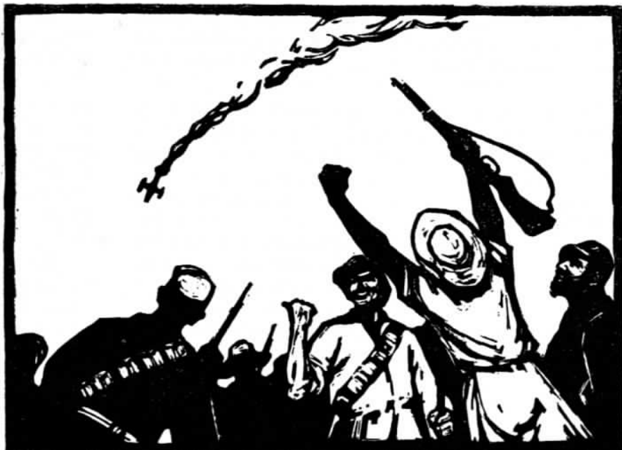
Defend Cuba! Defend the Revolution!

Meanwhile indications mount that the United States intends to use its Guantanamo naval base in Cuba as a bridgehead for armed attack against the Cuban people. As U.S. reinforcements and weapons for ground forces poured in to the naval base, the U.S. embassy in Havana