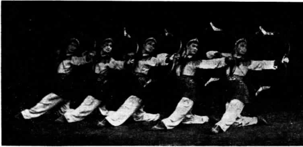
The Bow Dance from "The Small Knives Society"

oppression of the corrupt Ching Dynasty, and their determination to fight as well as their supreme confidence in ultimate victory. The dance drama is also a trenchant exposition of the ruthless Ching rulers' hand-in-glove manipulations with foreign imperialists—in this case, the British, U.S. and French imperialist who joined in 1855 to put down the peasant uprising. It drives home the truth that after the Opium War, the Chinese people, in order to overthrow the rule of feudalism, had to fight imperialism at the same time.