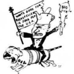
A U.S. presidential prospect

Contravening their agreements with Cuba, the Esso Oil Company and Texas Oil Company branches in Cuba have refused to process Cuban-owned oil. For this attempt to sabotage the Cuban economy, they have been requisitioned by the Cuban Government. In an angry TV speech, Nelson Rockefeller, Standard Oil Co. owner and U.S. presidential prospect, has called for the U.S. to take the lead in measures against Cuba. This oily paper tiger wants "joint action" by the other American states. This could be done under existing "international agreement," he declares, and would "save other nations from going the way of Cuba."