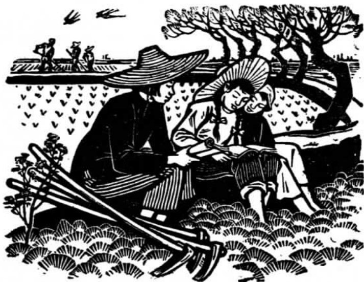
Noon Break: A Familiar Scene Now in the Countryside Woodcut by Li Hua

Writing goes hand in hand with reading. The difficulties formerly encountered in writing were greatly reduced by the process of spelling out the phonetic word and substituting it wherever a too difficult character appears. In this way the thought of the writer is not interrupted, nor is his language impoverished by a limited grasp of the written language. Up to the present, peasants in Wanjung have written some 1,900,000 ballads, songs and poems. Many are quite good. Thus not a few rural poets are emerging. Not long ago, the National Conference on Cultural Work in the Countryside sent an inspection group to the county. Some newly literate peasants were invited by the Vice-Minister of Culture Hsu Kuang-hsiao to write poems on the subject "Wanjung Is a Lovely Place." In