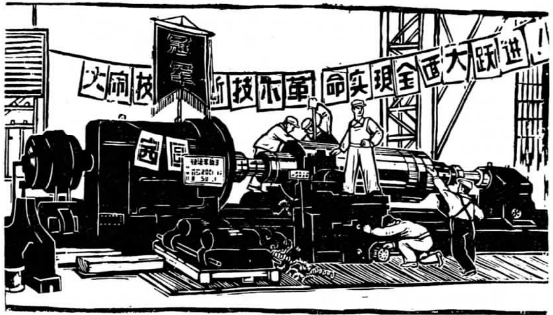
A Red Banner Workshop

There were zigzags in the course of the technical revolution. Not all accepted the new things with equal enthusiasm. Cooling fins cut on a special punch press fell from it in a random way at tremendous speed; three unskilled workers were employed to stack them. Tang Tao-ming, a young worker, made a device that stacked the fins and freed the three workers. It wasn't quite perfected however, and as a result there were a few rejects at times. Tang used the device during his shift but the workers on the next shift distrusted it and used to remove it. Encouraged by the Party branch, however, Tang and his colleagues proceeded to perfect the device. Finally it worked so well that the doubters began to use it and themselves set about making new labour-saving devices.