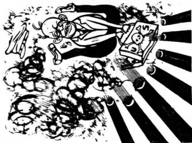
"Send Off" for the God of Plague

The Small Knives Society recounts in dramatic terms the heroic anti-imperialist and anti-feudal struggle of the people of Shanghai in the mid-19th century centring around the Small Knives Society led by Liu Li-chuan, Pan Chi-hsiang and Chou Hsiu-ying. It pictures with great fullness and graphically the distressing plight of the people who groaned under the