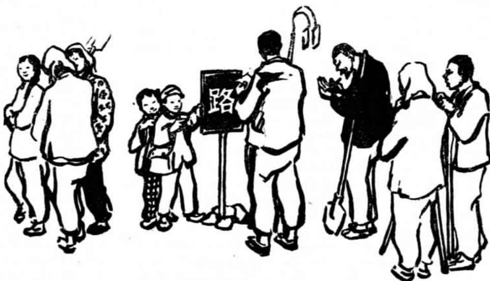
Pass the Word Test and the Road Is Open!

Says Gongren Ribao (The Daily Worker) editorially: "We should all learn from the splendid example of the Hsieh Family Village how to get greater, faster, better and more economical results in our workers' spare-time education as well as in socialist construction."