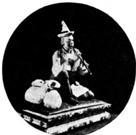
The Shepherd's Flute