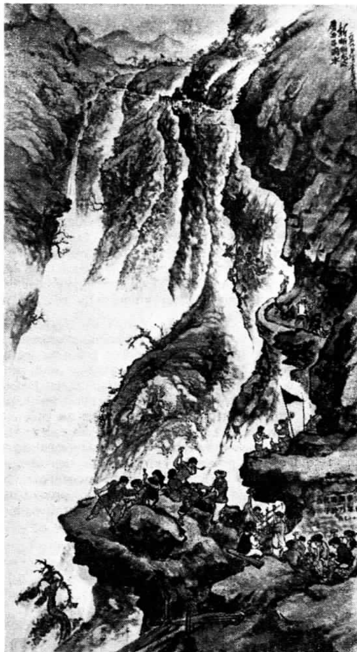
Cutting a Water Channel Along the Mountainsides

Soon an army of several hundreds was on the site and the project was launched. It was a difficult job working on these sheer cliffs and precipices. But the new spirit of the peasants, born of the revolution, worked wonders. When timber was called for, young people went into the mountains and hauled timber back to the site; when lime was needed, it was prepared in kilns the people had set up themselves. In five months, they built a 70-metre-long tunnel carrying the stream from the abyss out to the mountainside, into a canal cut