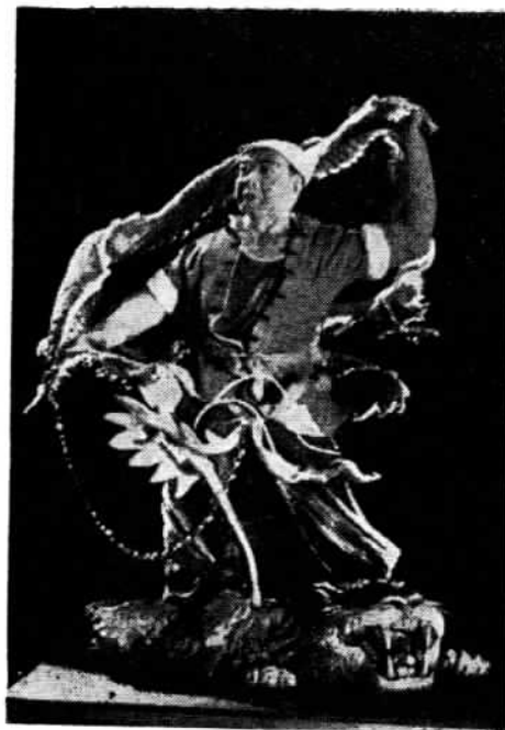
Taming the Dragons and Tigers