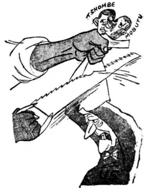
Where It Really Hurts

Some naive people, the editorial points out, originally were inclined to