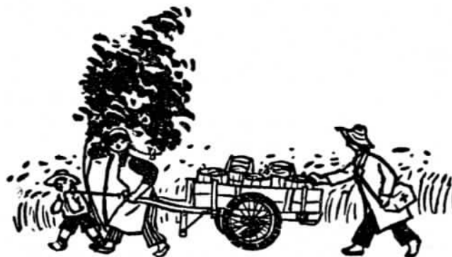
Catering and Health Services to the Fields

China today: "Do all you can for the man who is producing." Hence this attention to improving working and living conditions. Precisely because the leadership is doing this at this same time as it attends to production problems, community dining-rooms in factories and mines alike are being better run.