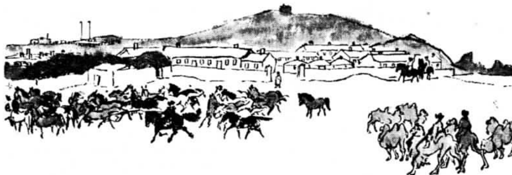
New Settlement in the Grasslands

The grain and fodder base of Khudilt Brigade of the Bayanbulag People's Commune in the Udiumtsen Banner is a typical example of these settlements. It has several dozen houses and a score or so yurts. Some fifty families of Mongolian and Han commune members are engaged in farming here. They gathered in a spring wheat harvest grown on more than 2,000 mu which they opened up to crops this year. They also planted another 12,000 mu with wheat, millet, rape, potatoes, carrots and other crops. The brigade has also branched out into other activities as well. It has teams for smelting iron and doing woodwork. Its general store provides commune members with goods and articles in daily use. Community dining-rooms have also been set up. Sanitation and the health of the community are looked after by a doctor permanently stationed here. Increasing prosperity has brought the brigade more and better welfare service—impossible to imagine in the days of nomadic herding.