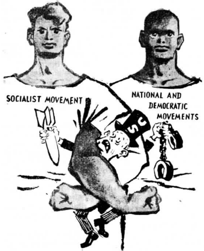
Unity Is Strength

The Moscow Declaration points out that reliance must be placed on the joint struggle of the forces of the socialist camp and all peace-loving forces in order to avert world war, and to strive for lasting world peace. It says: "The cause of peace is upheld by the powerful forces of our era: the invincible camp of socialist countries headed by the Soviet Union; the peace-loving countries of Asia and Africa taking an anti-imperialist stand and forming, together with the socialist countries, a broad peace zone; the international working class and above all its vanguard — the Communist Parties; the liberation movement of the peoples of the colonies and semi-colonies; the mass peace movement of the peoples; the peoples of the European countries who have proclaimed neutrality, the peoples of Latin America and the masses in the imperialist countries themselves are firmly resisting plans for a new war. An