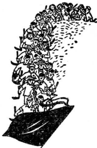
To the Countryside

building a democratic and socialist Tibet.