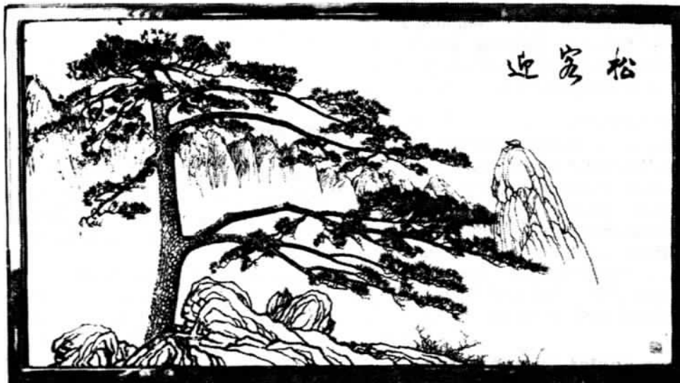
The Pine That Welcomes Guests on Mount Huangshan