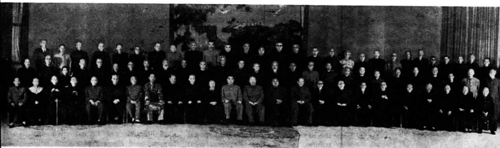
Tung Pi-wu, Vice-Chairman of the People's Republic of China, Premier Chou En-lai, Chairman of the National Committee of the Chinese People's Political Consultative Conference, and other government leaders with veterans of the 1911 Revolution

Anshan, the main sinew of China's growing steel industry up in the northeast, reports that since the beginning of the year, it has added 28 types of rolled steel to its already extensive catalogue. These new products are giving a big boost to the country's engineering, mining and building industries and the railways; and agriculture is not the least to benefit. The new low alloy channel beam being made there on special order for the Loyang Tractor Works has greater tensile strength than the ordinary beams made before; it will enable the Loyang works to manufacture more powerful machines without a big increase in overall structural weight. The big motor works in Changchun is getting a new type of deep-stamping sheet for the cabin top of its "Liberation" lorries. A special alloy steel with great impact toughness even at 60 degrees below zero meets the urgent need of China's booming oil industry. With train traffic steadily increasing, Anshan's new high silicon steel rail, three times more durable than the ordinary carbon steel rail, is a welcome addition to the many types of rails it is making. Using cold instead of hot rolling methods, Anshan's mills are turning out six new types of steel sections for the building industry.