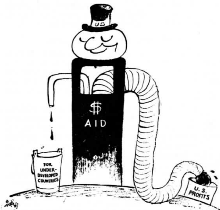
Washington's "Aid" Pump

According to statistical data released by the U.S. Department of Commerce, direct private U.S. investments in foreign countries over the years have been used first of all to plunder the raw material resources of other countries. Direct U.S. foreign investments started first in mining and plantations. Once started, a mining enterprise can be developed continuously. It does not usually require large amounts of new investments and the volume of investment does not grow at a rapid rate. In recent years the increase in private U.S. investments in agriculture has been relatively small. This is because synthetic substitutes have been found for natural rubber and fibres and furthermore plantations which own large tracts of land and hire large numbers of local workers to be exploited like slave labour have usually become the first target of public wrath and the demand for nationalization in foreign countries. There has been a very fast increase in investments in oil industry particularly since World War II. In 1959 investments in oil, mining and