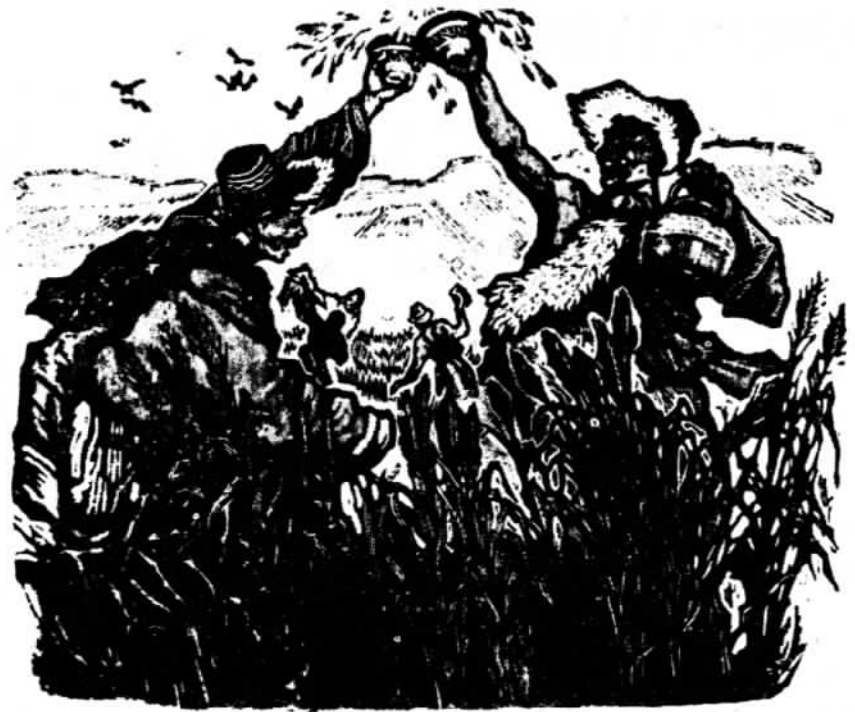
Woodcut by Chao Tsung-tsao

The Kirin Chemical Co., one of the major chemical works in the country, has turned out more than 40 kinds of chemical raw materials this year for many light industrial concerns in 28 provinces, cities and autonomous regions. These include calcium carbide for the plastics industry; large quantities of wood alcohol and sodium nitrate for factories manufacturing