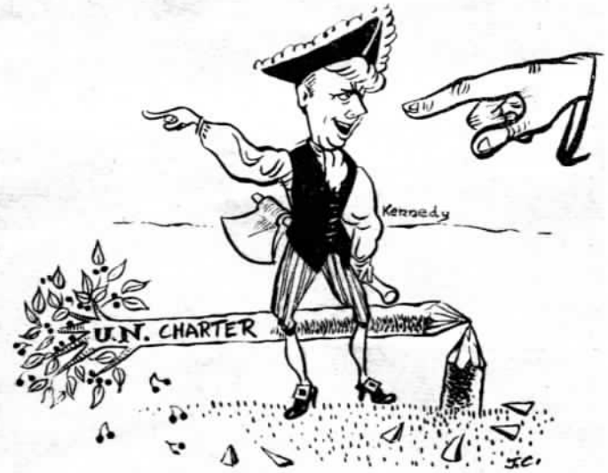
George Washington's successor: "No, I didn't do it. It was the Russians!"

No capitalist employer is afraid to take the lie detector test. They can all pass with flying colours. The lie detector is powerless against inveterate liars. Say you ask