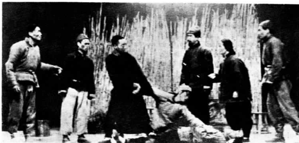
“The White-Haired Girl” produced by the Lu Hsun Art Academy in Yenan in 1945

The villagers welcomed us with open arms, receiving us as “men sent by Chairman Mao to help in their fanshen (literally, ‘turning over,’ or ‘liberation’).” In those war years, the people’s government’s policy was to get rents and rates of interest reduced. But not all the landlords in the Liberated Areas were law-abiding, and they played all sorts of tricks to keep the peasants under their thumb. Life for the poor peasants and hired