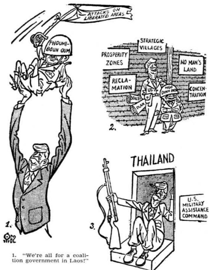
1. "We're all for a coalition government in Laos!" 2. "We've brought 'prosperity' and 'civilization' to south Viet Nam." 3. "Military occupation for your security. . . ." Cartoon by Ko Chao-chuan

The New York Herald Tribune disclosed on May 15 that if the U.S. "show of force" failed to produce the desired effect, it would use its Seventh Fleet and marines to "take an active part" in the "fighting" in Laos and south Viet Nam and to have "much of Southeast Asia... drawn in, and that might not be the end." Obviously,