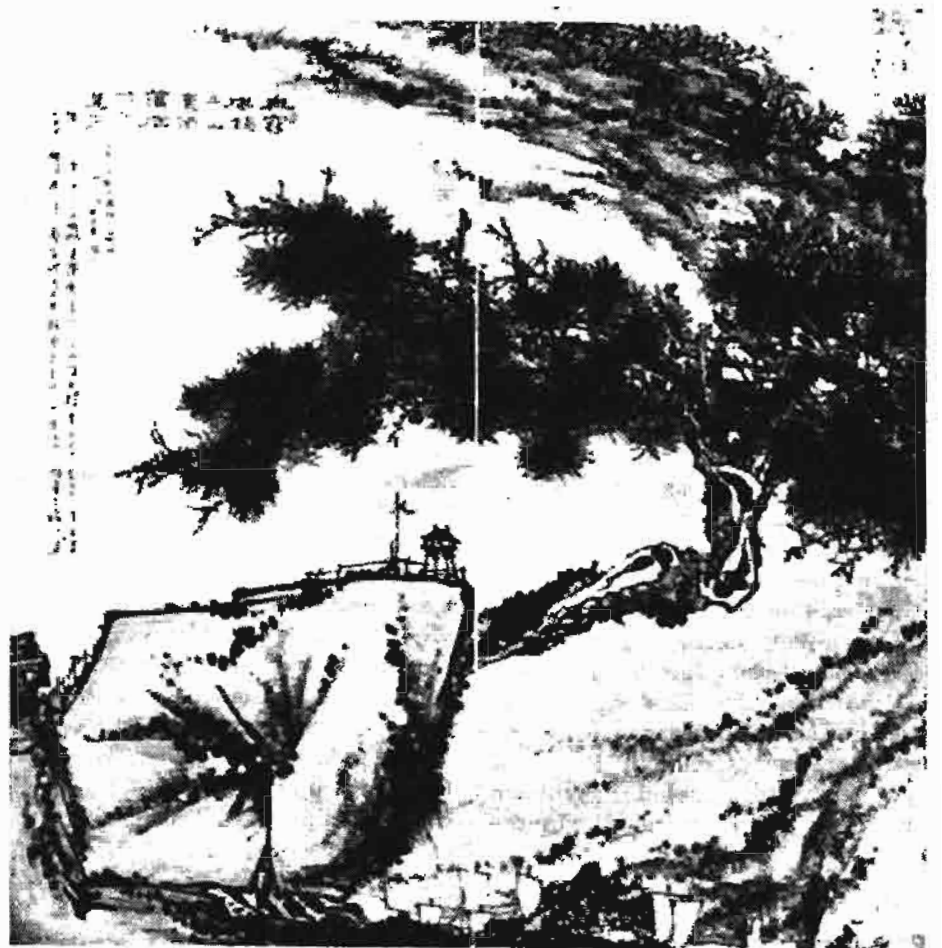
Fleet Transports Sail the Misty River