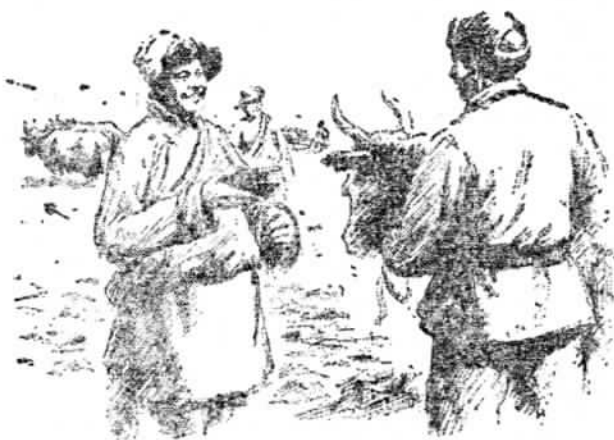
Men of the people's armed forces helping farmers in the fields

The frontier guards soon solved what for a moment seemed a tricky problem. They each took a morsel of mutton and taking out from their rations a generous quantity of salt — a much-prized condiment in these parts — handed it to the hunter.