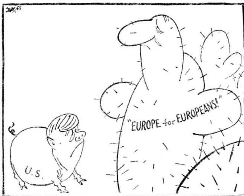
De Gaulle's "New Frontier" Around the Common Market Cartoon by Fang Cheng

In spite of these protests and professions of sympathy with Britain it is quite impossible for the rest of the Common Market countries to part company with de