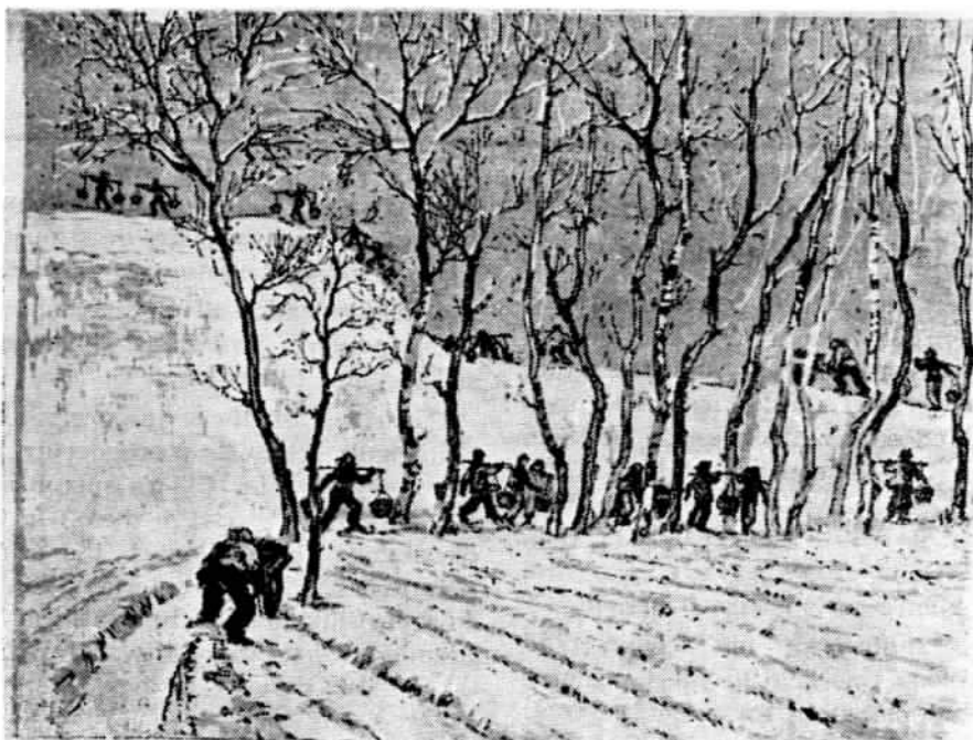
Farm Work in Winter