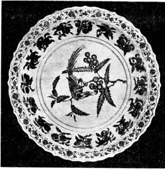
Blue-and-white, of the Hsuanteh period of the Ming Dynasty. H.9.8 cm. Diameter of rim 51.2 cm. Diameter of base 34.5 cm. (Viewed from above)

(960-1279). The Sung craftsmen achieved a delicate celadon colour of great beauty, they excelled too in their forms and decorative designs. This volume gives examples of the fine porcelain products made by nearly all the famous Sung kilns — the Ting, Ju, Kuan, Ko, Lungchuan, Chun, Yaochow and Chingtehchen. Specimens from kilns in Hopei and Honan producing wares for the common people are also included.