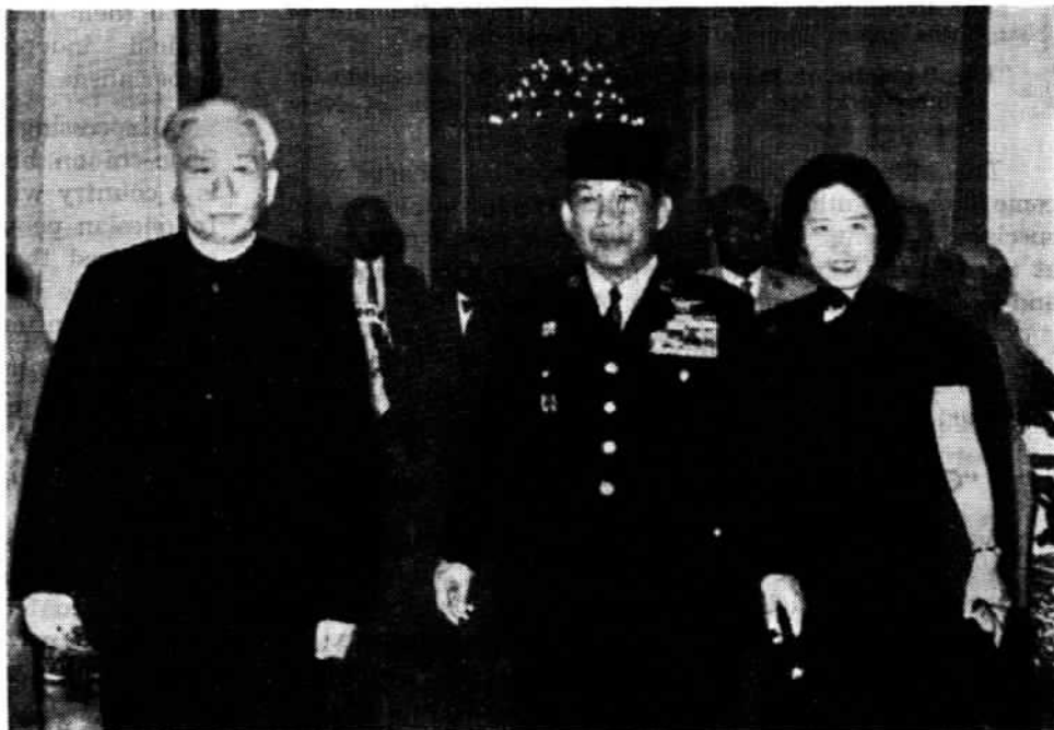
Chairman Liu Shao-chi, President Sukarno and Madame Liu Shao-chi at the Independence Palace.

"Taiwan is the legitimate territory of the People's Republic of China, just as West Irian is of the Republic of Indonesia,"