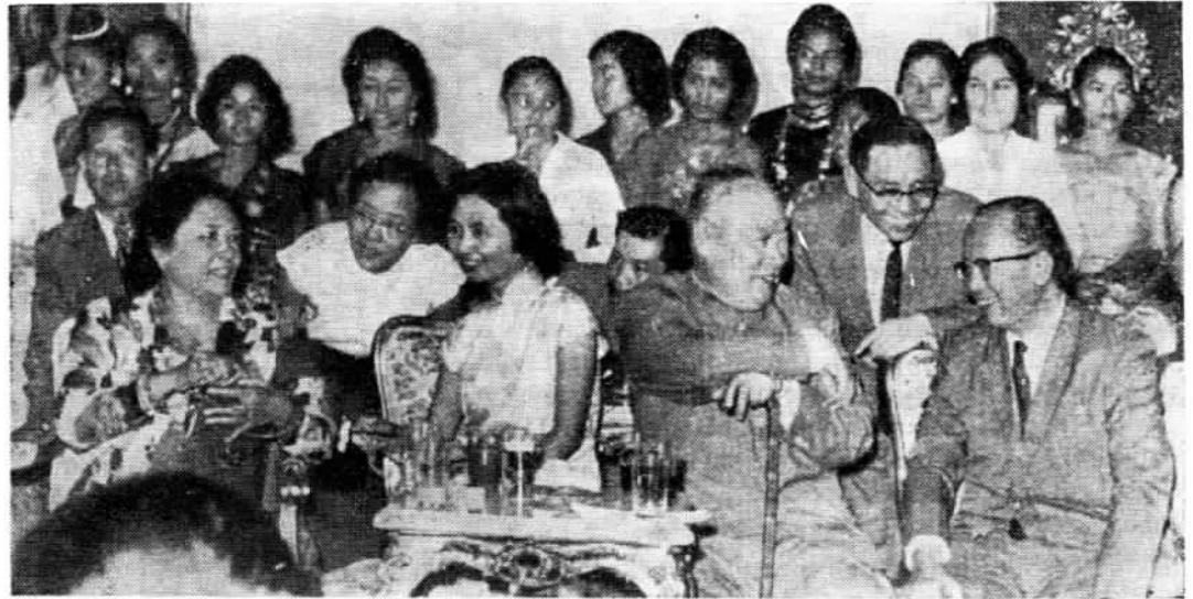
Vice-Premier and Foreign Minister Chen Yi and Madame Chen Yi having a cordial talk with Indonesian Chief Minister Djuanda and his wife

With deep appreciation Chairman Liu Shao-chi said: "The Republic of Indonesia has become an important force opposing imperialism and colonialism and safeguarding