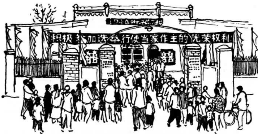
City District Election