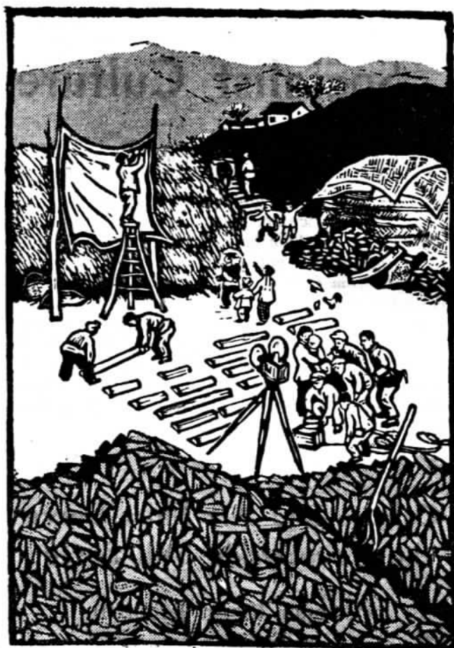
A mobile cinema team comes to a village Woodcut by Chiu Chen-teh

An intense struggle is now going on in the countryside between the old and the new. The peasants are fighting a hard battle to build a new life. In their struggles to conquer nature and to transform their environment, they have also transformed themselves ideologically and spiritually. By going into the midst of rural life, by serving and maintaining close contacts with the peasants, living alongside the peasants and joining in in their struggle, our writers and artists will not only reform and temper themselves but also enrich their knowledge of life and struggle, and become intimately acquainted with the