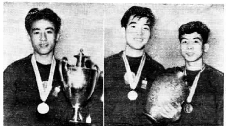
Chuang Tse-tung, men's singles champion