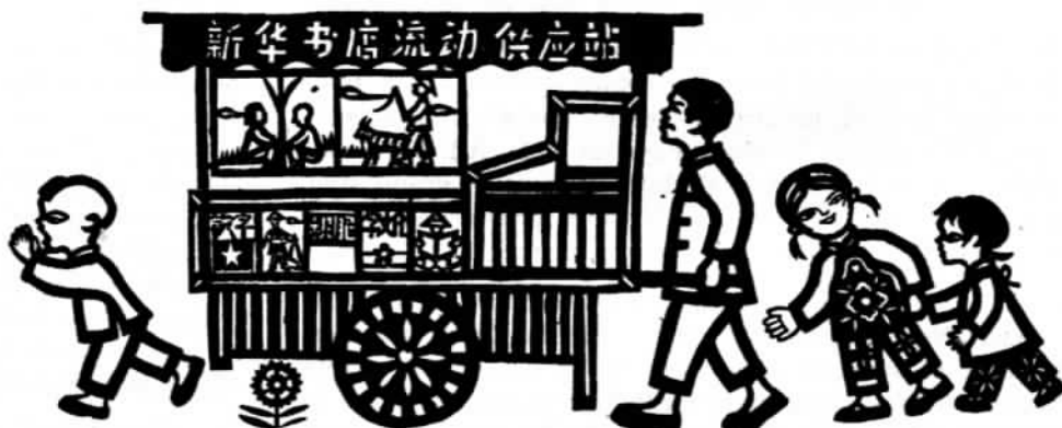
"The Hsinhua Bookstore is coming. . ."