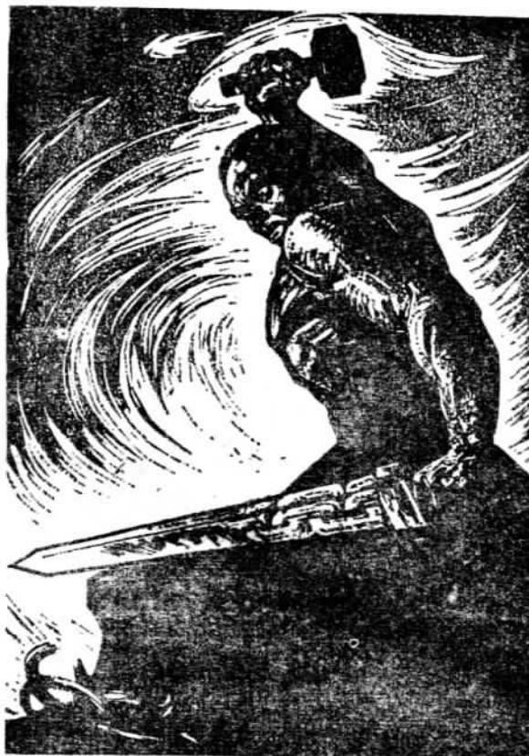
Forging Shackles Into Swords

Other folk musicians and singers from the Hechehs, China's smallest nationality with only 700 people, as well as the Tibetans, Dahurs, Yaos and other national minorities have written and published their ballads, songs and poems.