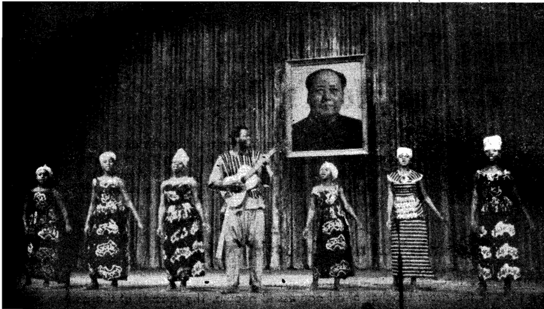
"Militant Africa Eulogizes Mao Tse-tung and His Great Cause," a song performed by the Guinean "Djoliba" National Dance Troupe, now visiting China. A stanza runs:

"Your writings — a source of limitless strength; Your thought — a never-setting sun; It lights up vast China, And also the hearts of the world's militant people."