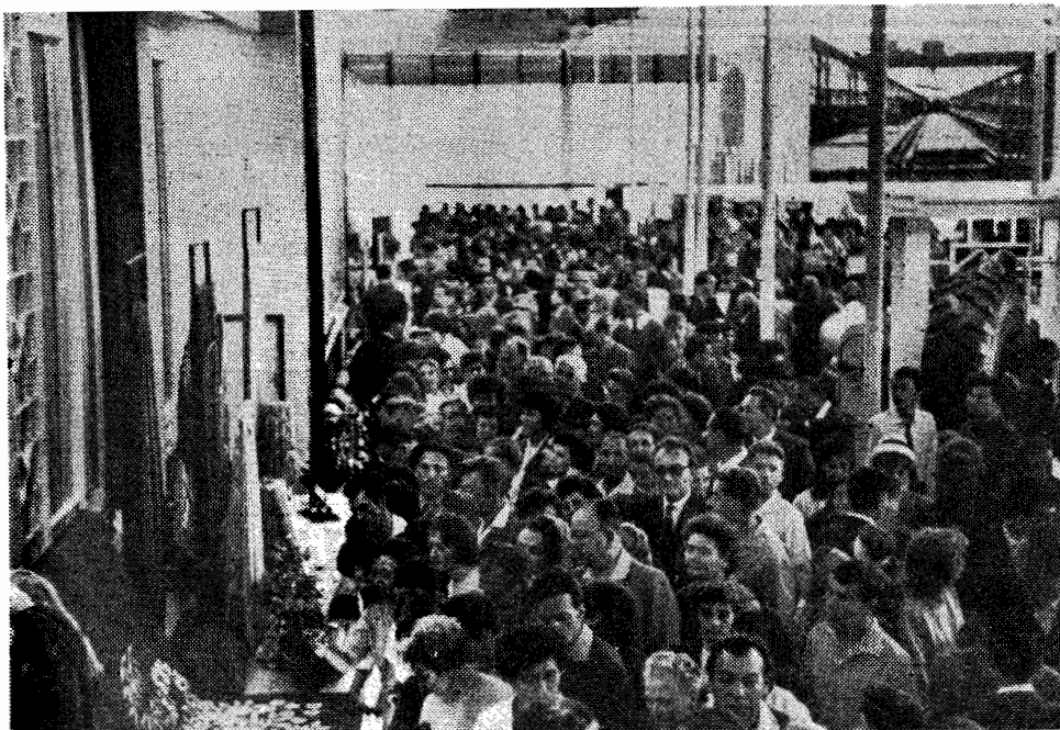
Inside the Chinese Pavilion at the Budapest International Fair

Many foreign visitors extended warm greetings to the Chinese personnel. A Laotian student said, "You have scored tremendous successes in these years. Some countries speak ill of you and report nothing about China in their papers. Your exhibition shows that your achievements are enormous, and everybody sees this clearly." A Cameroonian student said, "To us Africans, your achievements show what we should do in our struggle and in building up our country." Clasp- ing the hand of one of the Chinese staff, a Soviet visitor said with great emotion: "My heart goes out to China." His wife, standing by his side, was very close to tears as her husband said these words. A Czechoslovak designer said, "China's development is rapid. Mao Tse-tung is a brilliant leader." Several Greeks wrote in the visitors' book: "The pavilion is very brilliant, yet the most brilliant is not the pavilion but the political line of Marx, Engels, Lenin, Stalin and Mao Tse-tung. Without Mao Tse-tung's political line, the pavilion could not be so brilliant."