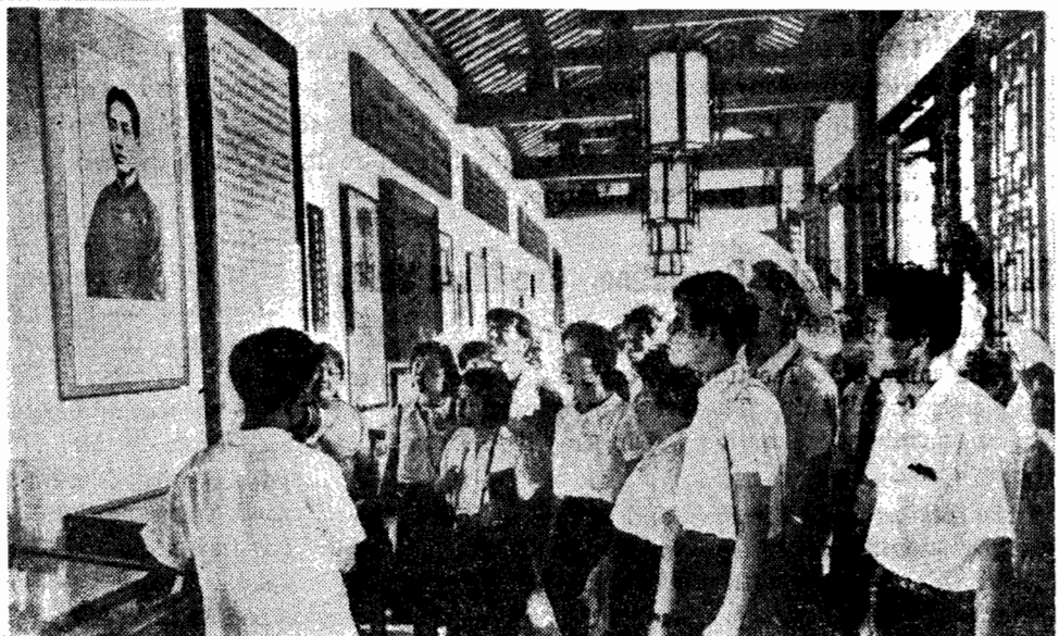
Young Japanese visitors at the National Institute of the Peasant Movement in Canton where Chairman Mao Tse-tung taught in 1925-26.