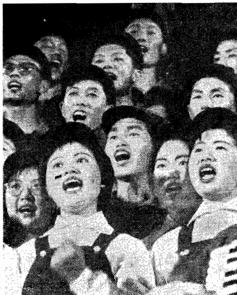
The Shanghai Oil Refinery choir sings its own "Song of the Oil Refinery Workers"

Shanghai's workers, peasants and soldiers and revolutionary professional singers, dancers and musicians in this festival performed songs and dances which powerfully projected Mao Tse-tung's thought. There were items driving home Chairman Mao's thought on never to forget the class struggle and showing his ideas that the masses are the real heroes and that people's war is the most effective weapon against imperialism and its lackeys. Other items reflected his teachings to build the country through thrift and diligence in a revolutionary spirit of hard work and self-reliance. Still others paid tribute to the Chinese people armed with Mao Tse-tung's thought, especially the worker, peasant and soldier heroes who, with daring and revolutionary heroism, are bringing about earth-shaking changes. In song, music and dance, performers extolled the glorious achievements of China's socialist revolution and socialist construction and expressed the boundless love and respect of the people of China's many nationalities for Chairman Mao.