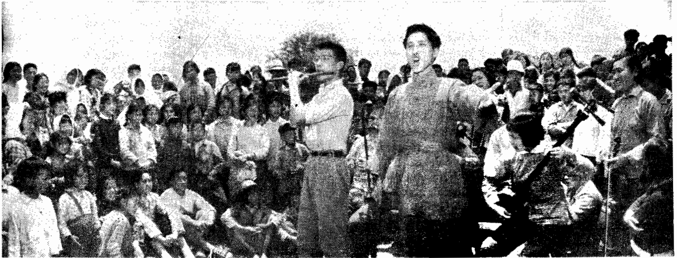
A troupe from the Shanghai Conservatory of Music performing its festival items in a rural people's commune

tung's great thought. They staunchly defended and extolled it and popularized it with vigour. The festival is a fruit of this great thought as well as an ode to it."