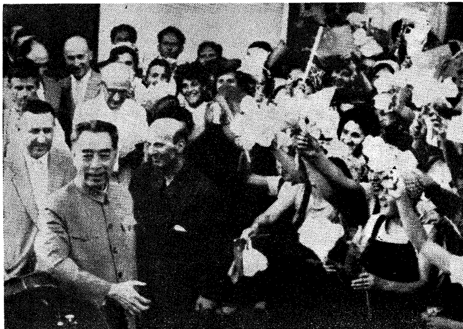
Comrade Chou En-lai with workers of the Tirana Tractor Spare Parts Plant

Tirana's welcome for its Chinese guests reached its climax at Skanderbeg Square in the heart of the city. Thousands of people filled the big square. A thousand artists performed the dance With Pick in One Hand and Rifle in the Other and episodes from the modern Chinese drama A Great Wall Along the South Coast . Acrobats performed Chinese acrobatic feats. A chorus of 300 voices accompanied by an orchestra of 100, sang Peking-Tirana and songs in praise of Chairman Mao Tse-tung. A contingent of 1,500 gymnasts in colourful sportswear gave an impressive display of callisthenics. Atop a great steel frame in the centre of the square stood two gymnasts holding aloft the Chinese and Albanian national flags, symbol of the militant unity of the two countries.