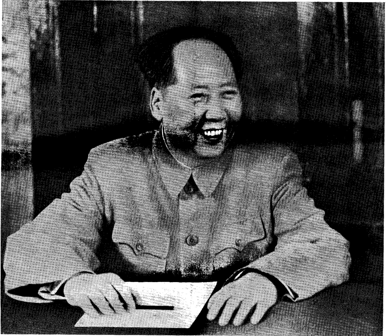
Chairman Mao Tse-tung, the great leader of the Chinese people