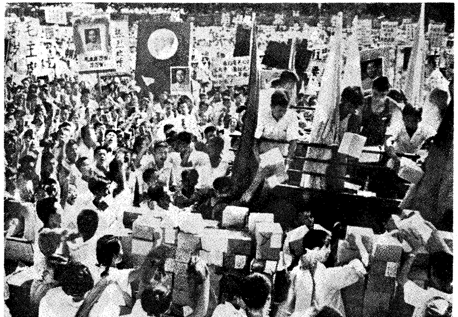
Students of the Peking Iron and Steel Institute greet the arrival of new copies of the Selected Works of Mao Tse-tung

The Party Central Committee decision was made to satisfy this urgent demand, and the people are grateful from the bottom of their hearts for the great political concern the Party has shown them.