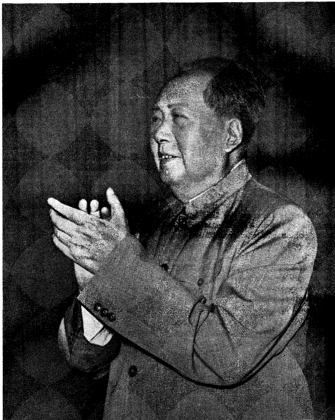
Chairman Mao at the Eleventh Plenary Session of the Eighth Central Committee of the Communist Party of China

tion is one of a new all-round leap forward emerging.