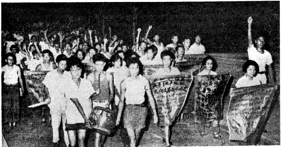
Revolutionary teachers and students of Shanghai's East China Teachers' College elatedly greet the 16-point Decision at an evening demonstration