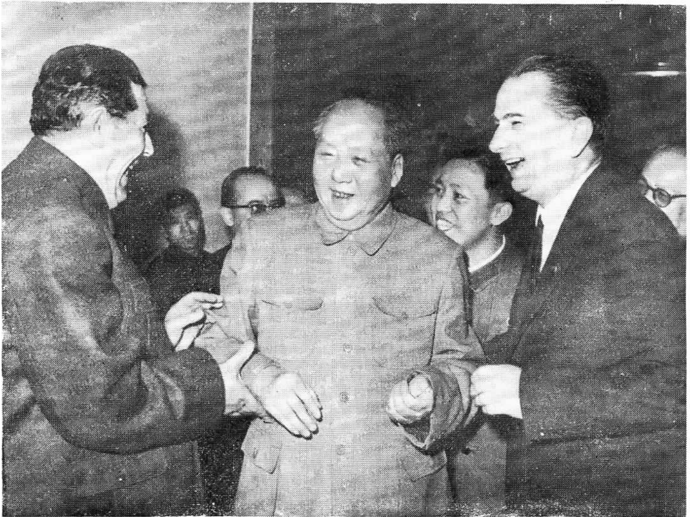
Chairman Mao with Comrades Hysni Kapo ( right ) and Beqir Balluku ( left )