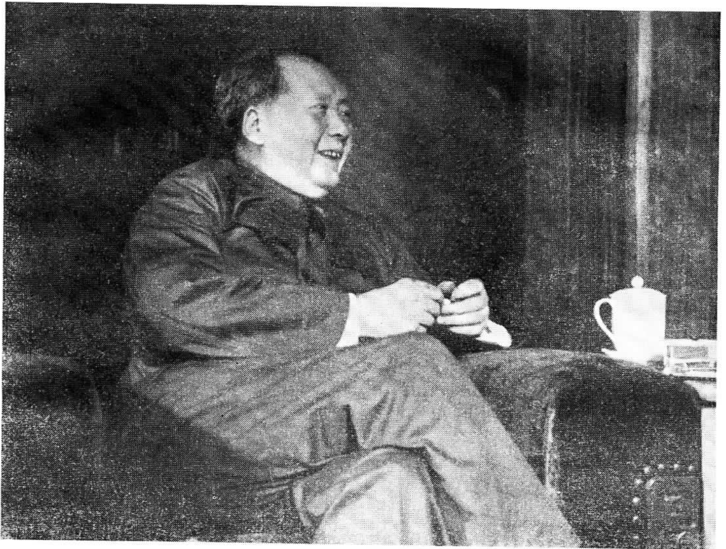
Chairman Mao Tse-tung

Our great teacher, great leader, great supreme commander and great helmsman