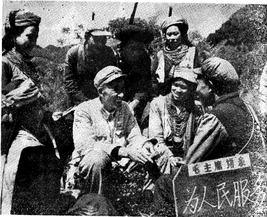
A P.L.A. work-team member (second from left in front row) disseminates Chairman Mao's latest instructions among the Lisu people in the Yunnan border region.

trained a great many coaches to help others study Mao Tse-tung's thought.