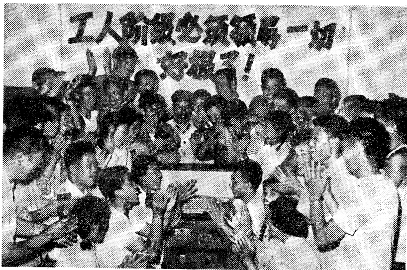
Members of the workers' Mao Tse-tung's thought propaganda team in Tsinghua University, composed of Peking workers and P.L.A. fighters, enthusiastically cheer the publication of Chairman Mao's latest instructions.