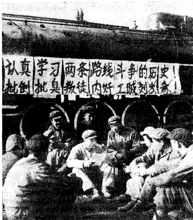
Through the re-study of Chairman Mao's report to the Second Plenary Session of the Party's Seventh Central Committee, these workers of the "February 7" Locomotive and Rolling Stock Plant in Peking and the P.L.A. men helping the Left in the plant are diligently studying the historical experience of the struggle between the two lines within the Party

In the great proletarian cultural revolution, in collaboration with the ghosts and monsters in society, Liu Shao-chi's agents in Taching launched desperate attacks on Chairman Mao's revolutionary line. But, armed with Mao Tse-tung's thought, Taching's working class has stood firm, and, one after the other, beaten back the counter-attacks of the class enemies from the Right or from the ultra "Left." It has smashed the renegade, traitor and scab Liu Shao-chi's fond dream of restoring capitalism in Taching, and made the red banner of Taching shine far brighter than ever.