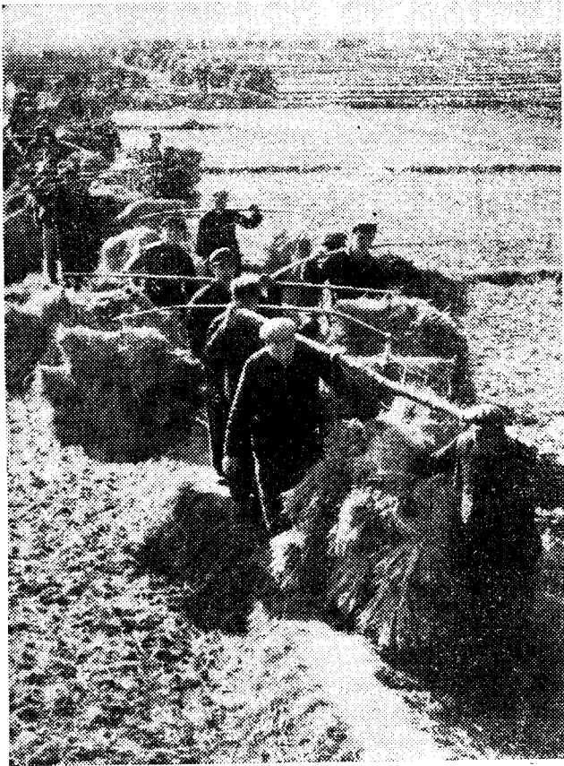
Cadres of the Heilungkiang Provincial Revolutionary Committee and commune members of the Xingsheng Production Brigade, Wachang County, bringing in newly harvested rice.

more deeply one understands Chairman Mao's revolutionary line. On no account should we neglect taking part in manual labour or forget to keep in contact with the masses."