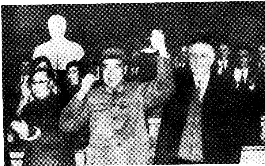
Comrade Enver Hoxha, the great leader of the Albanian people, and Comrade Huang Yung-sheng at the celebration meeting

Comrade Enver Hoxha, the great leader of the Albanian people and First Secretary of the Central Committee of the Albanian Party of Labour, Comrade Haxhi Lleshi, President of the Presidium of the People's Assembly, and Comrade Mehmet Shehu, Chairman of the Council of Ministers, attended the banquet.