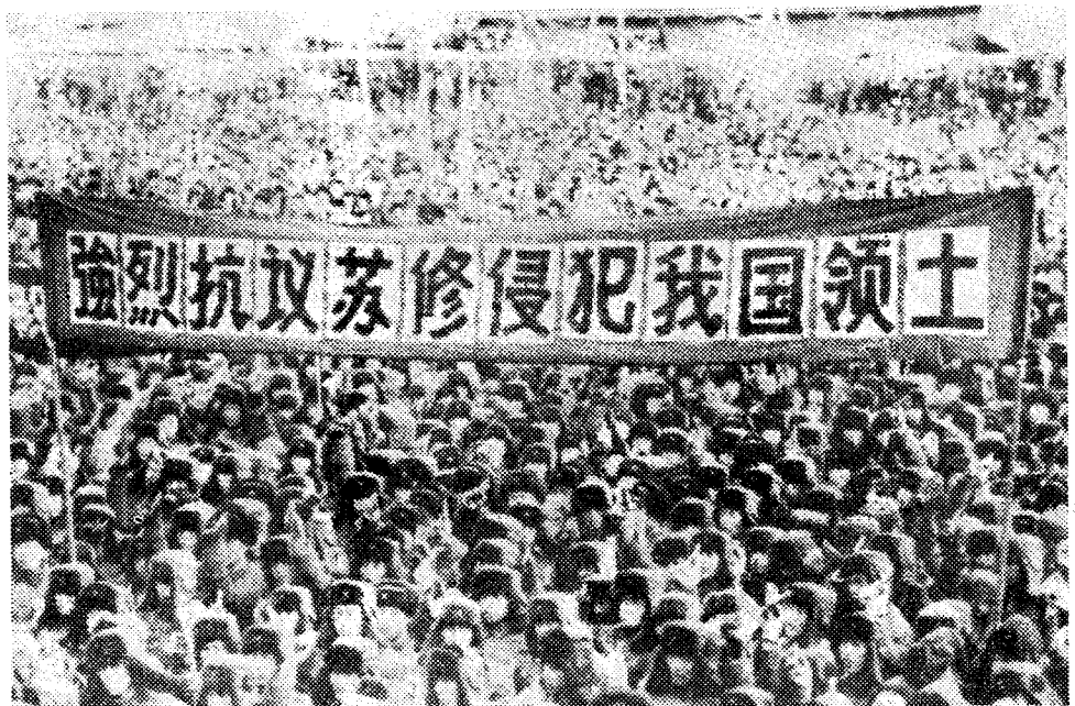
Armymen and civilians of Heilungkiang Province and the city of Harbin hold a rally to express their strongest protest against the extremely grave incident of bloodshed created by the Soviet revisionist renegade clique in a deliberate encroachment upon our country's territory.