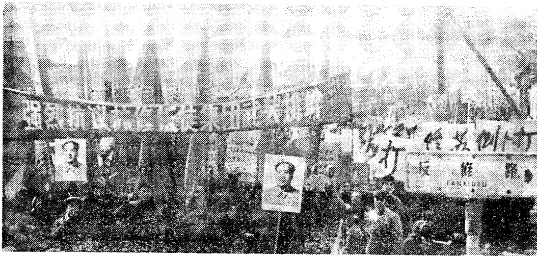
The working class and broad masses of the revolutionary people in the capital hold demonstrations in angry protest against the Soviet revisionists' armed provocation in our country's border region in Heilungkiang Province.

revolutionary friendship, and the revolutionary people of the world will certainly bury them once and for all.