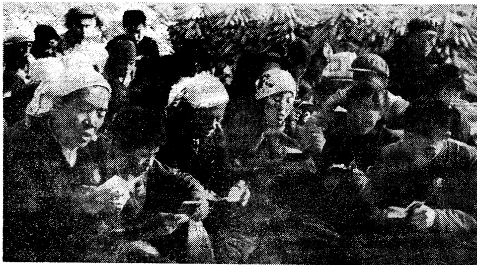
The Tachai people give first place to the living study and application of Mao Tsetung Thought in all work and have thus reaped bumper harvests for eight years running. Photo shows them studying Chairman Mao's works.

They said that, fourthly, with Mao Tsetung Thought they could clearly see that all things have a dual character, and therefore they could turn a bad thing