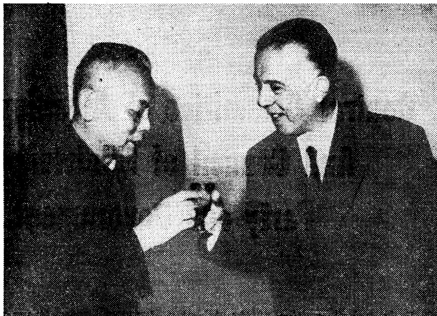
Comrade Enver Hoxha and Comrade Li Hsien-nien toast to each other.

The brilliant victories won by the Chinese people in the Great Proletarian Cultural Revolution, initiated and led with genius by Comrade Mao Tsetung himself, further increased the grandeur and tremendous strength of red China which has become today a great, invincible socialist power with a powerful economic potential, with a very much advanced science and technology which has attained the world's highest level, and with an invincible defence power, capable of annihilating any ag-