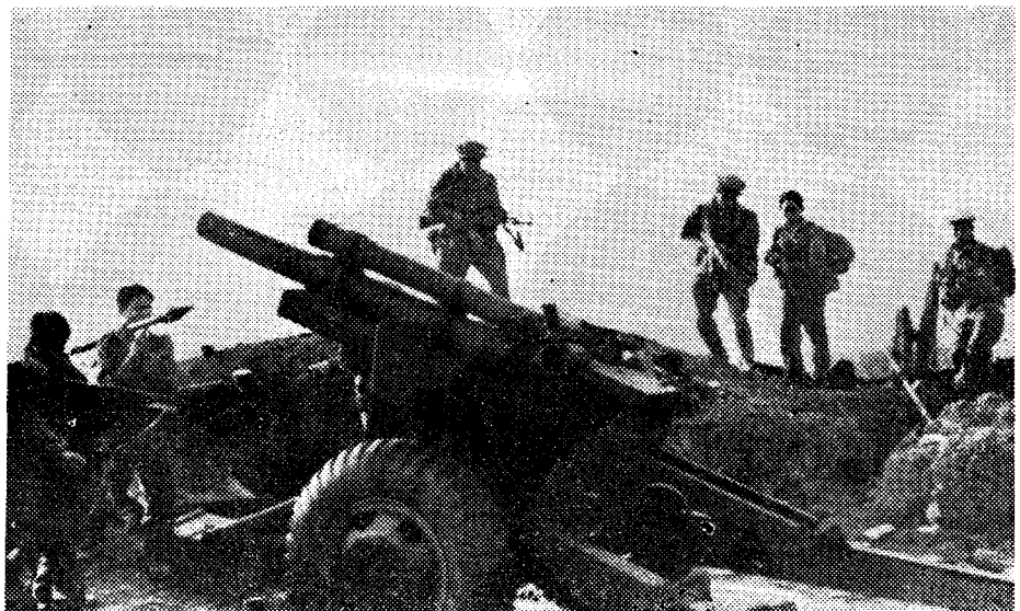
The Laotian People's Liberation Army captures an enemy position.

Since the beginning of the 1969-70 dry season, especially since U.S. imperialism expanded its war of aggression to the whole of Indo-China by sending troops to invade Cambodia, the Laotian patriotic armed forces and people have further strengthened their fighting solidarity with the Cambodian and Vietnamese peoples, and badly battered U.S. imperialism, throwing it into difficulties both at home and abroad. The Laotian patriotic armed forces have not only won back the Plain of Jars-Xieng Khoang area, but also liberated Attopeu in late April and Saravane City and its surrounding areas in early June, both of which are important strategic points in Lower Laos. This has linked up the liberated areas of Laos, the Tay Nguyen liberated area of south Viet Nam and the northern liberated area