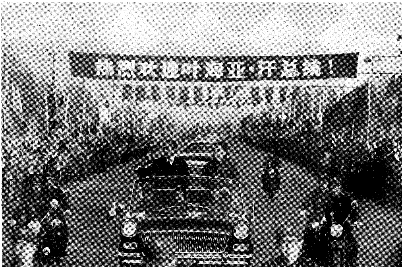
Riding in an open car with Premier Chou En-lai, President Yahya Khan receives a warm welcome from crowds lining the several-kilometre-long thoroughfare.