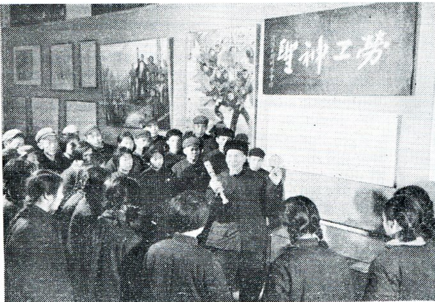
A veteran of the February 7, 1923 strike recounts the heroic deeds of the strikers at the February 7 Exhibition Hall in Chengchow.

Showing great concern for the people in the affected area, Chairman Mao, the Central Committee of the Chinese Communist Party and the State Council promptly organized the departments concerned to take part in relief work.