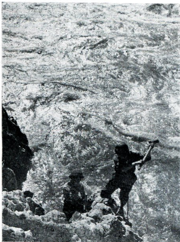
Hammering out dynamite-holes on the banks of the Wuchiang River to blast protruding rocks.

F ILM distribution and showings have increased rapidly in north China's Shansi Province since the start of the Great Proletarian Cultural Revolution. Of the film projection teams formed throughout the province in the past few years — the