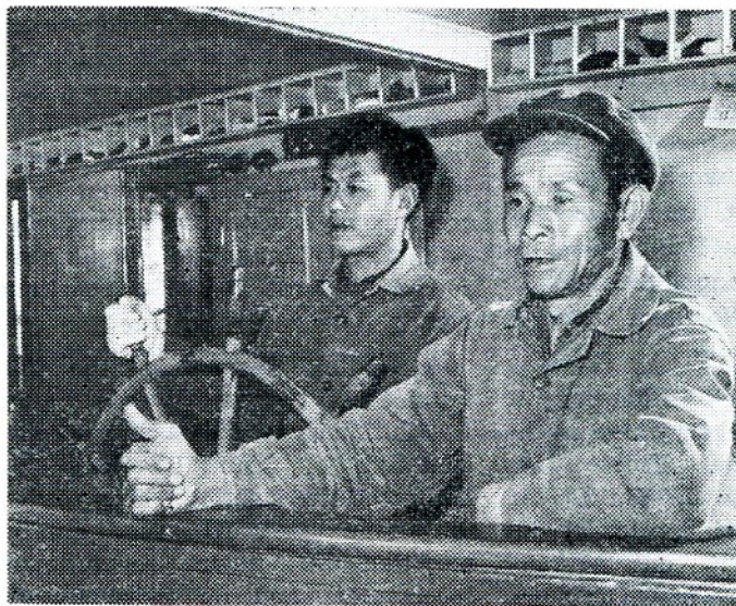
An old boatman (right) who volunteered as Red Army guide during its forced crossing of the Wuchiang has now become steamship captain on the river.

reaches for 500 kilometres, with the lower reaches open to night navigation as well.