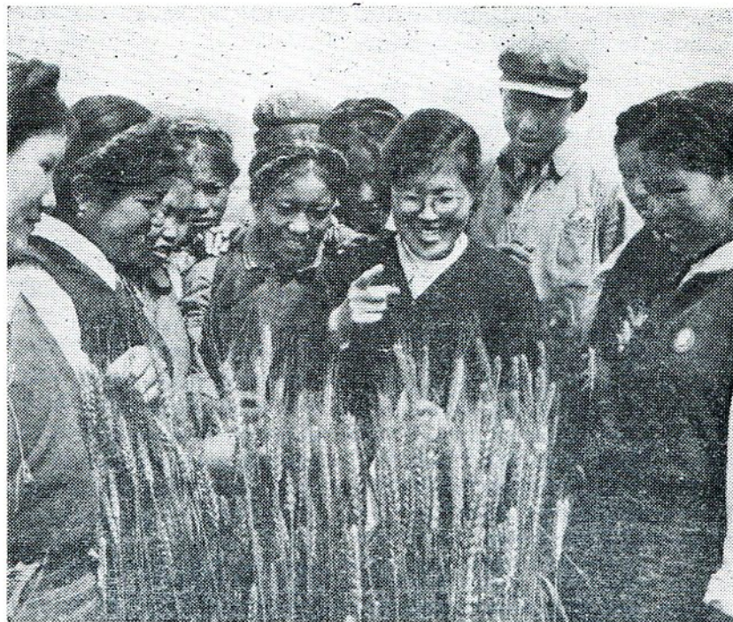
A scientist at a Tibetan experimental farm introducing a high-yielding, cold-resistant wheat strain to Tibetan peasants.

The Party and the People's Government have paid great attention to seed breeding and special scientific research institutes have been set up. Large numbers of scientific and technical personnel have been trained. Chairman Mao summed up the practical experience of the Chinese peasants and scientists and in 1958 put forward the Eight-Point Charter* for agriculture, in which improved seed strains are listed as one of the eight principal factors for achieving good harvests. Since then agricultural scientific experimentation has developed with added vigour. Apart from those research institutes at and above the provincial level, many