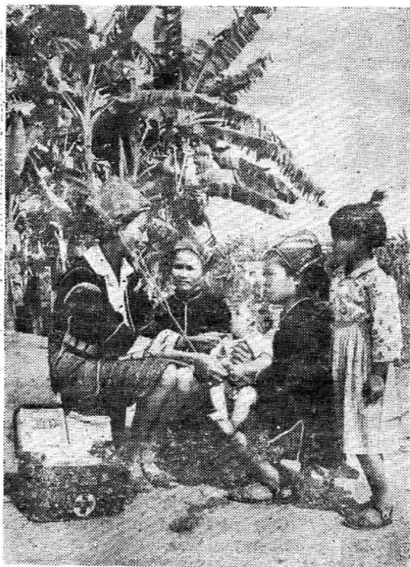
A "barefoot doctor" of the autonomous chou of the Li and Miao peoples in Hainan Island, Kwangtung Province, treating commune members.

Mongolian medicine with a history of some seven centuries has been revived and developed. At the No. 2 People's Hospital of Paotow, the department which has been studying this school of medicine has trial-produced some new medicines and altered the composition of some