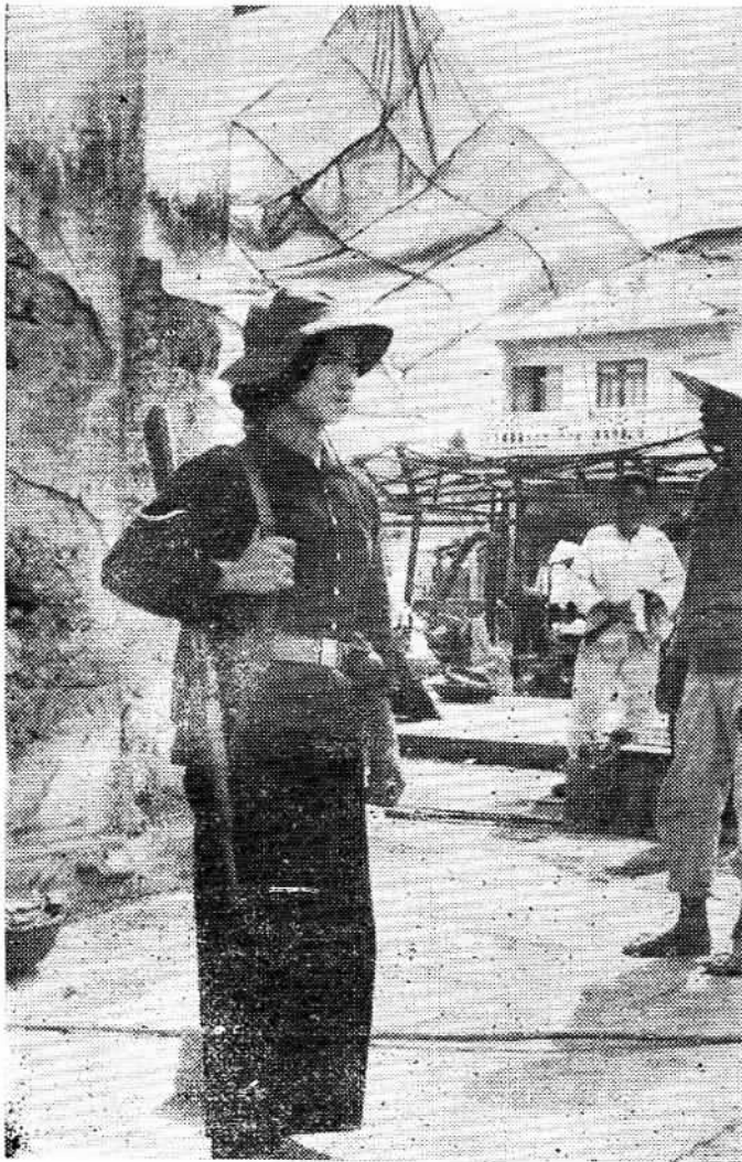
A vigilant fighter of the South Viet Nam Liberation Army on guard at Dong Ha city.

We visited Trieu Hoa Village in Trieu Phong District where the war had wiped out all the 3,000 houses, 600 water buffaloes, 2,500 pigs and an enormous number of poultry and over 80,000 bombs had cratered its fields. But the wartime spirit of staunch fighting reasserted itself. Difficulties were surmounted and rehabilitation was soon afoot. The villagers had already built enough houses, filled in the bomb-craters and planted 130 hectares of rice. After the rice harvest, the village would have as much as over two-thirds of the grain it needed. In this village we met Le Quang Thai, an old man of 72 who had risked his life and all to shield cadres and support the revolution during the war of