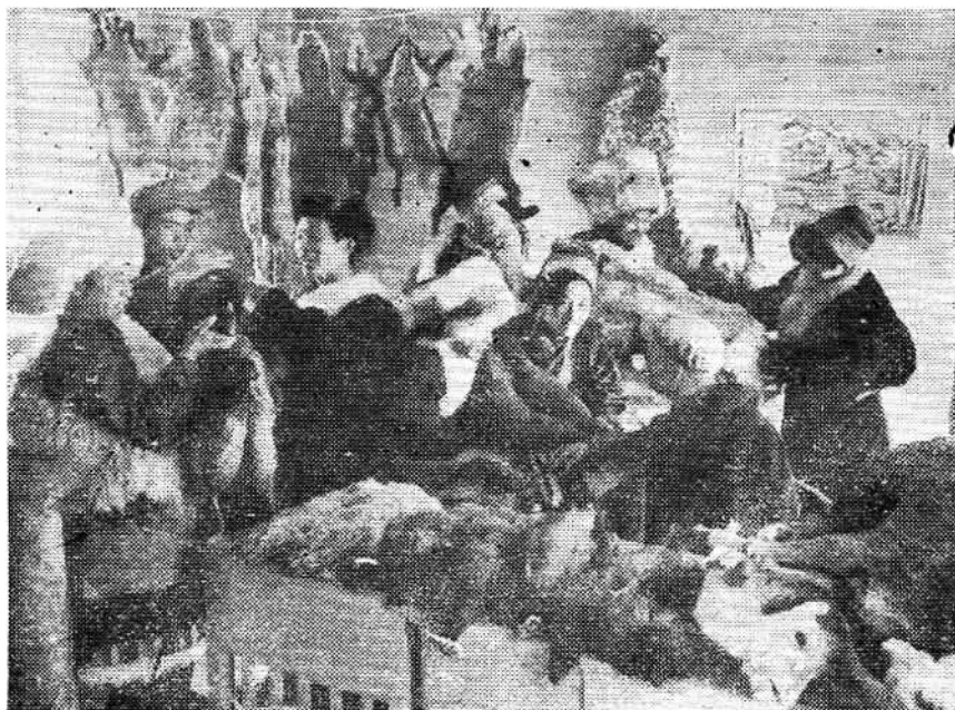
Commune members selling game to the state.

The price of animal products bought by the state has been raised year after year, while those of daily necessities supplied to the pastoral regions have dropped. Before liberation, communications were poor, and herdsmen were at the mercy of merchants and herdowners. In spring and autumn, the herdsmen drove their camels and yaks carrying livestock produce through high mountains and wildernesses for months to reach some point of exchange and get a few articles they needed. For 100 kilogrammes of wool they sometimes obtained only 6 kilogrammes of tea; a live sheep got a few metres of cloth and a sheepskin a box of matches. Now the same quantity of wool can be exchanged for 133 kilogrammes of tea, a live sheep for some 30 metres of cloth and a sheepskin for 500 boxes of matches. This rational price policy has been an incentive to the development of stock-breeding.