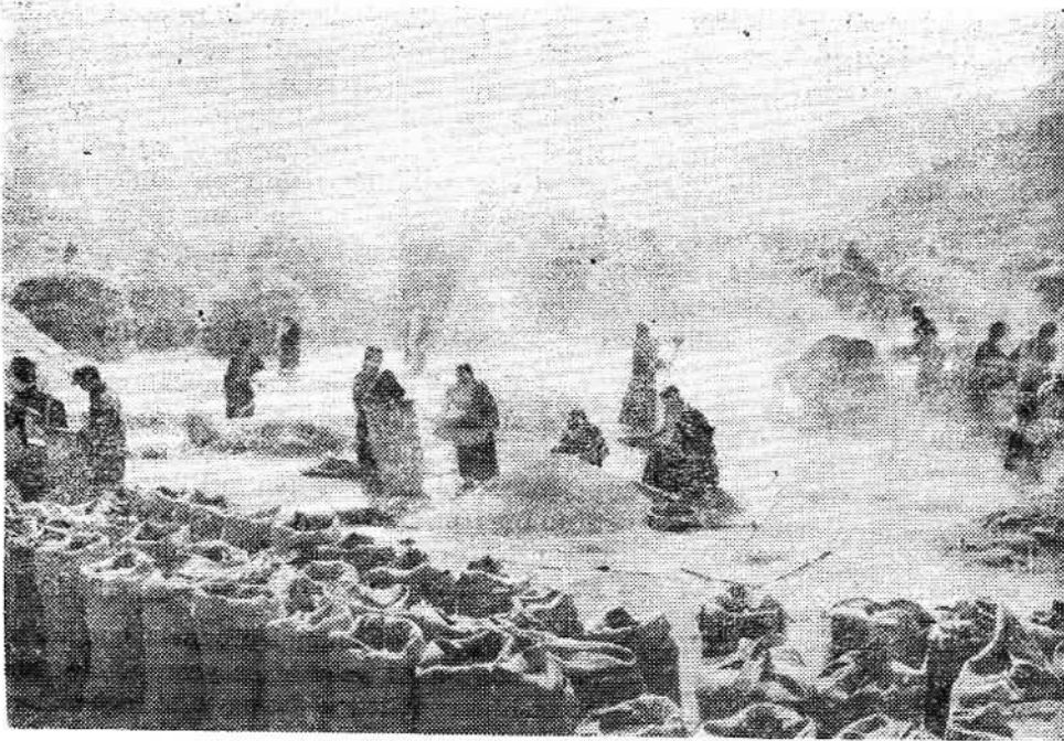
A production team threshing floor.

melted snow, rivers and ground water. The water in the ditches we saw came from a mountain spring. Even on Tangla Mountain 5,000 metres above sea level there were brooks and streams which had once flowed away unused.