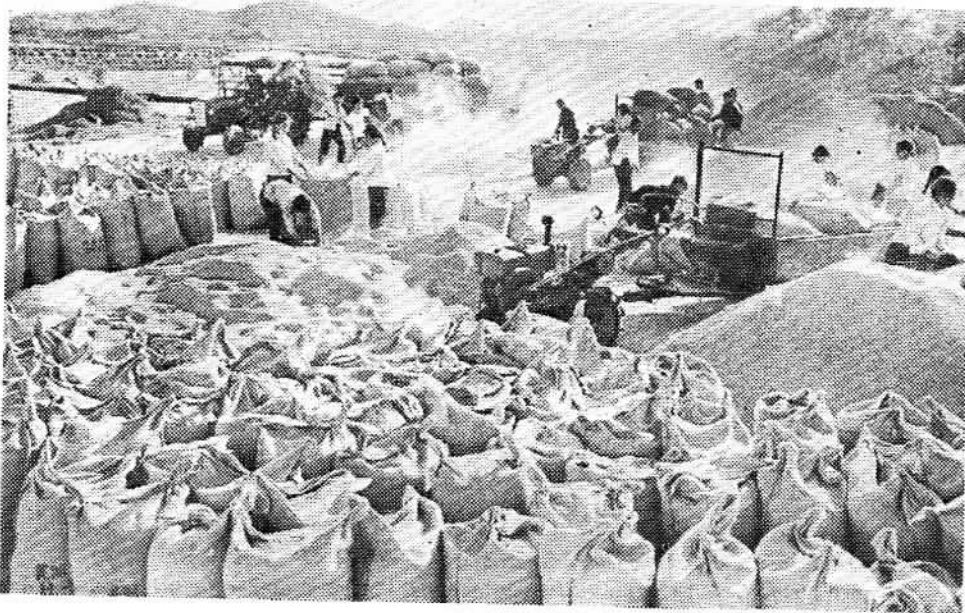
Another rich harvest.

fertilizer plants, coal mines, cement works and hydro-power stations — which have mushroomed in all parts of the country are playing a big part in helping farm production. The output of small chemical fertilizer plants in 1971, for instance, accounted for more than half the nation's total.