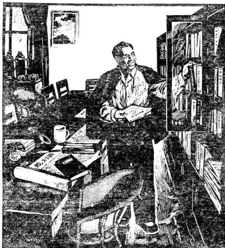
A studious Party committee secretary.

It is quite common that comrades always run into the contradiction between time for work and time for study; for leading cadres especially, this may be quite