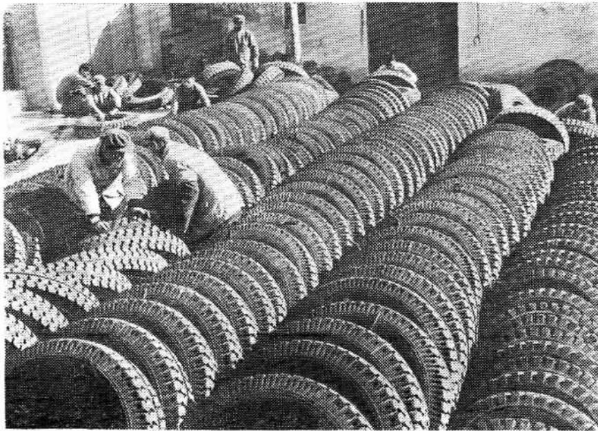
Rubber fires manufactured by the Amoy Rubber Plant.

in the country. Twenty years ago when it was founded there were only 57 workers. Now there are six times the number of workers, eight