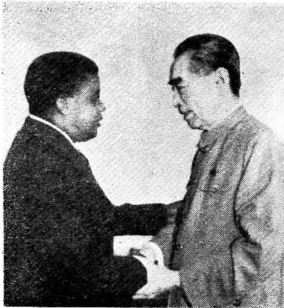
Premier Chou En-lai meets Commissioner of State for Foreign Affairs Victor Saude Maria.

The message said: "The independence of the Cape Verde Islands is a major victory won by the people of Cape Verde and Guinea-Bissau after waging a protracted and valiant struggle under the leadership of the African Party for the Independence of Guinea and Cape Verde, and it marks another new achievement of the united struggle of the African people. As always, the Chinese Government and people will firmly support the Cape Verde Government and people in their just struggle."