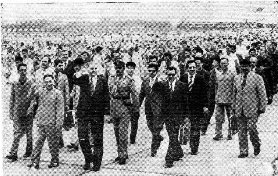
The Iraqi guests receive a warm welcome on their arrival in Peking.