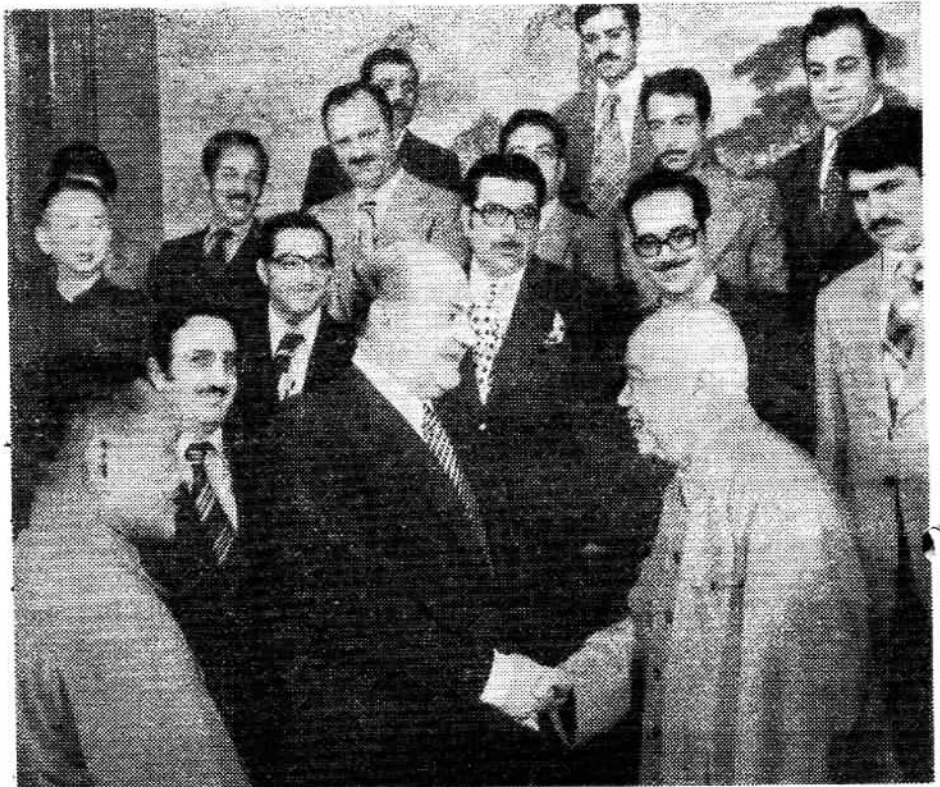
Chairman of the Standing Committee of the National People's Congress Chu Teh shakes hands with Vice-President Marouf.

"Premier Chou En-lai also met Vice-President Marouf. Vice-Premier Teng Hsiao-ping and Vice-President Marouf held talks in a sincere and friendly atmosphere. The two sides exchanged views on major international issues of common interest and