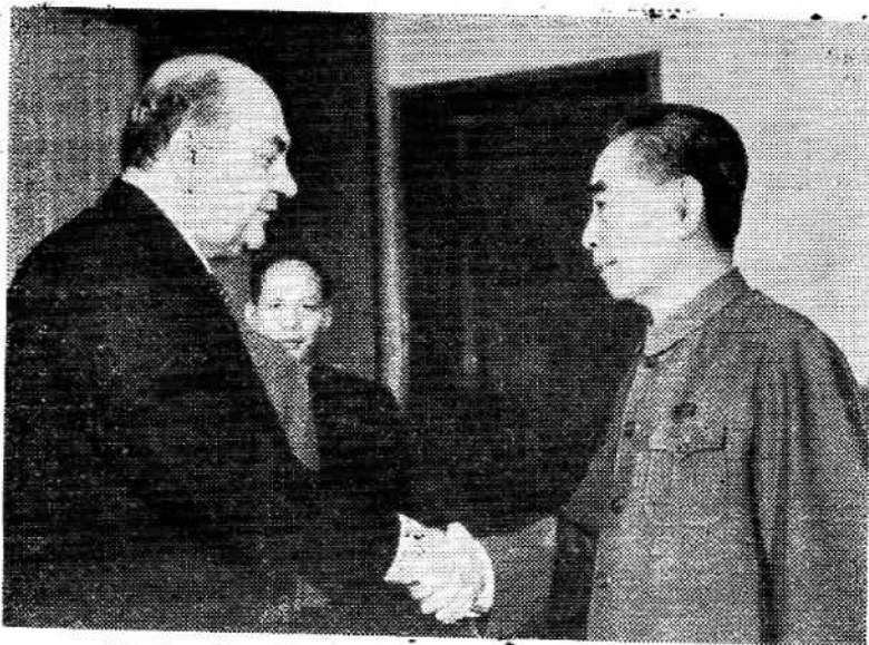
Premier Chou En-lai meets Vice-President Marouf.