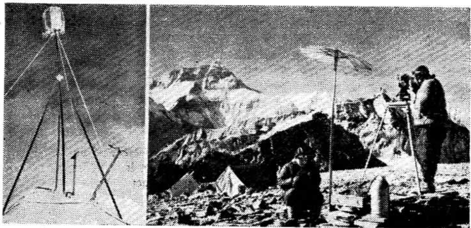
(Left): The three-metre-high red metal surveying pole erected on the summit of the Qomolangma Feng by Chinese climbers.