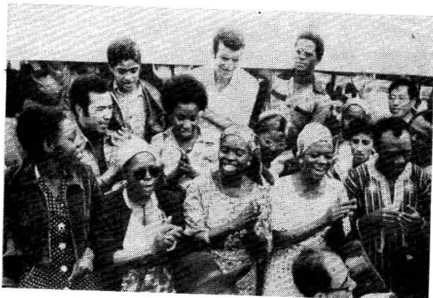
A happy get-together on a boat.

and it is exactly this common struggle that has closely united the players and peoples of the various countries and regions.