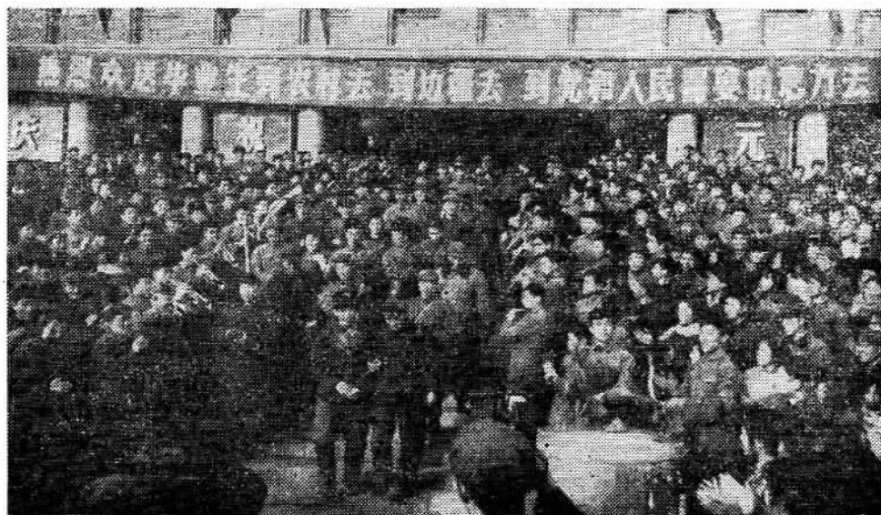
Tsinghua University giving a warm send-off to this year's worker-peasant-soldier graduates who are going to the border areas and countryside.

Intensive study of revolutionary theory gives the current debate a clear line of orientation in accordance with Chairman Mao's teachings and adds to the far-reaching significance of this debate. A leading member of the university Party committee said: "Today's struggle may arise again and again in the future. We must not only win this struggle but, more important, we should help educate the masses and arm them with Marxism-Leninism-Mao Tsetung Thought. Once Chairman Mao's revolutionary line takes root in the minds of the people, we will have no fear of revisionism be-