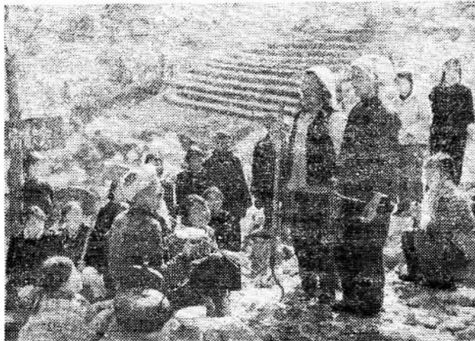
Reciting poems during a break in a rural production team.

Warm praises of Chairman Mao, the Communist Party, the Great Proletarian Cultural Revolution and socialist new things are common subjects in the poems from all the three municipalities, where poem-writing is characterized by mass participation and close connection with present-day struggles. The Peking Working